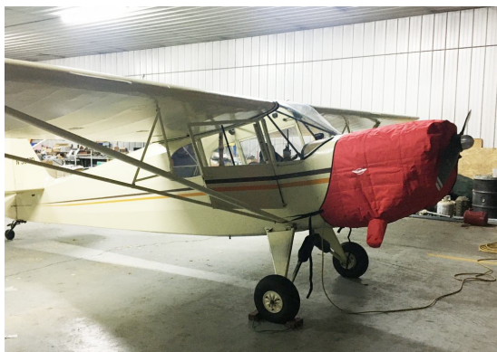
Taylorcraft DC-65 Insulated Engine Cover

This cover type is made from Silver Acrylic Sunbrella canvas and is 100% lined with a soft and smooth microfiber. Bruce's Custom Covers developed this material combination especially for aircraft protection. The outer material is medium weight and treated for water resistance, UV resistance and anti-static buildup. The inner lining is a very soft and smooth microfiber to prevent scratching. The material is very reflective, and tests show that the cabin interior temperature can be reduced to near-ambient temperature on the hottest of days. It is water, ice and snow repellent, yet breathable to allow moisture to escape from between the cover and the aircraft surface.