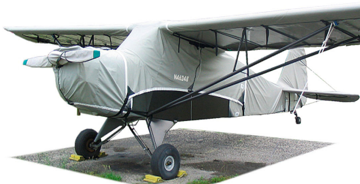
Prop Cover, Engine Cover, Canopy Cover, Wing Covers and Empennage Cover