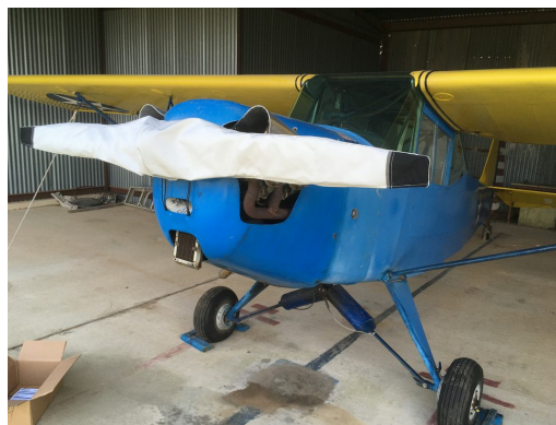
Taylorcraft L-2 Grasshopper Propellor/Spinner Cover