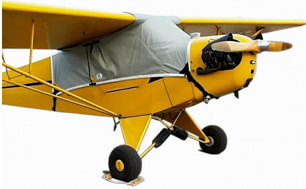
Piper J3 Canopy Cover

This cover type is made from Silver Acrylic Sunbrella canvas and is 100% lined with a soft and smooth microfiber. Bruce's Custom Covers developed this material combination especially for aircraft protection. The outer material is medium weight and treated for water resistance, UV resistance and anti-static buildup. The inner lining is a very soft and smooth microfiber to prevent scratching. The material is very reflective, and tests show that the cabin interior temperature can be reduced to near-ambient temperature on the hottest of days. It is water, ice and snow repellent, yet breathable to allow moisture to escape from between the cover and the aircraft surface.