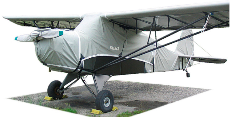
Prop Cover, Engine Cover, Canopy Cover, Wing Covers and Empennage Cover