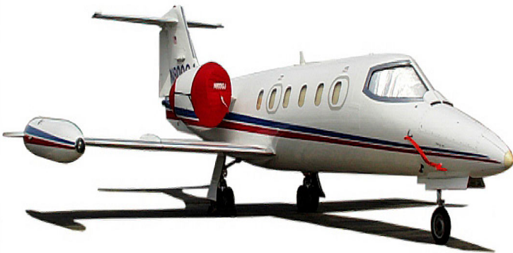
Lear 35 Engine Covers, Pitot Covers & Cockpit HeatShields

The Lear 24 & 25 Bikini Style Engine Covers are a single-piece design using a soft and smooth stretchy and fabric. The cover stretches tightly over both the intake and exhaust, installing quickly and easily. These covers are designed to be used as hangar dust covers and have a useful life of approximately one year.