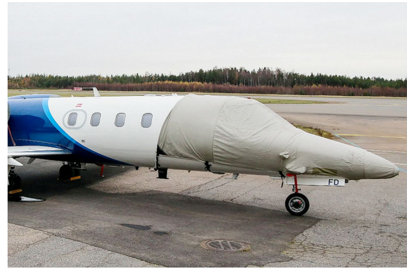
Learjet Cockpit/Nose Cover