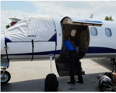
Lear 31A Cockpit Cover