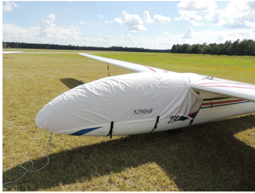
Blanik L23 Canopy/Nose Cover, All Year Use

the hottest of days. It is water, ice and snow repellent, yet breathable to allow moisture to escape from between the cover and the aircraft surface.