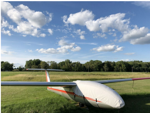
L-23 Super Blanik Canopy/Nose Cover