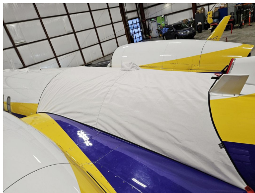
Lear 45 Empennage Saddle Cover W/ Dorsal Inlet Plug (Covers Upper Fuselage Between Pylons, Acm/Apu Area)