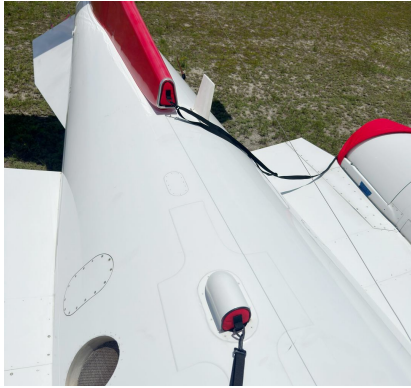
Lear 45 Dorsal, ACM & Fuel Vent Inlet Plugs

The Engine Inlet Plugs are custom fit for your Lear Models 40 & 45 intakes, made with heavy-duty vinyl material, and stuffed with a single block of sculpted urethane foam. Each plug has a zipper that allows the foam to be removed and dried if necessary. Engine plugs have 'remove before flight' streamers sewn onto the face of the plugs. Most plugs are imprinted with the aircraft registration number in black for an extra charge. Storage bag NOT included. Engine plugs may be inserted after flight when the engine is still warm. Engine Inlet Plugs are commonly referred to as Cowl Plugs, Intake Plugs, Cowl Blocks, Engine Blocks, and Engine Bungs.