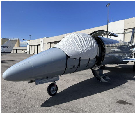
Lear 45 Cockpit Cover

This cover type is made from Silver Acrylic Sunbrella canvas and is 100% lined with a soft and smooth microfiber. Bruce's Custom Covers developed this material combination especially for aircraft protection. The outer material is medium weight and treated for water resistance, UV resistance and anti-static buildup. The inner lining is a very soft and smooth microfiber to prevent scratching. The material is very reflective, and tests show that the cabin interior temperature can be reduced to near-ambient temperature on the hottest of days. It is water, ice and snow repellent, yet breathable to allow moisture to escape from between the cover and the aircraft surface.