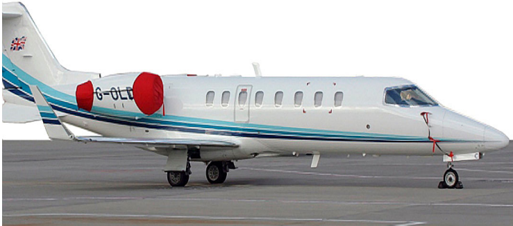
Lear 45 Engine Covers & Pitot Covers

The Lear Models 40 & 45 Bikini Style Engine Covers are a single-piece design using a soft and smooth stretchy and fabric. The cover stretches tightly over both the intake and exhaust, installing quickly and easily. These covers are designed to be used as hangar dust covers and have a useful life of approximately one year.