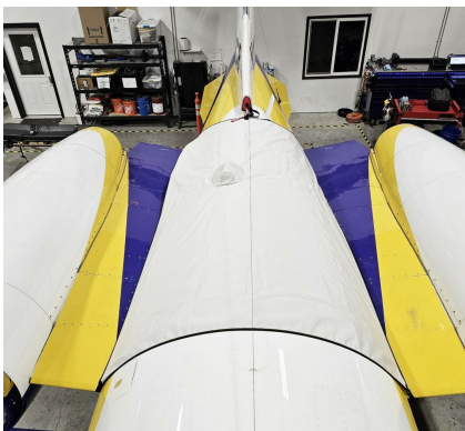
Lear 45 Empennage Saddle Cover W/ Dorsal Inlet Plug (Covers Upper Fuselage Between Pylons, Acm/Apu Area)

WINTER USE MATERIAL - Made with Solution-Dyed Polyester fabric, this option is intended for seasonal use to aid in deicing, rain mitigation, or for occasional travel. The material is lighter and more compact, but more susceptible to UV damage and may have a shorter useful life if used continuously outside than the all-year use material.