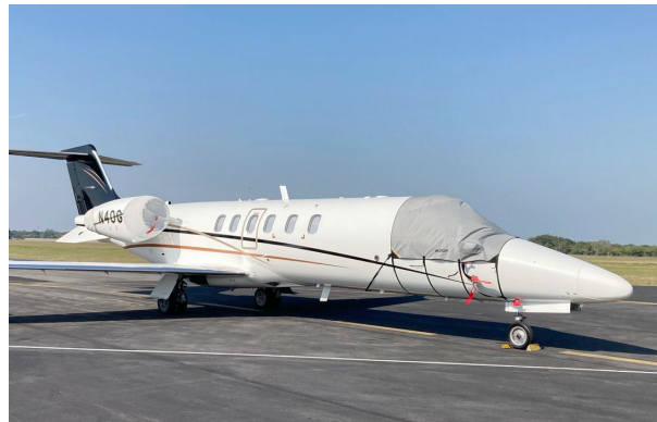
Lear 45 Light Weight Travel Cockpit Cover