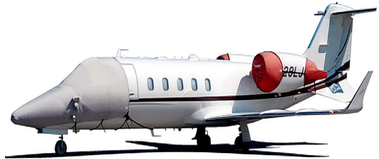
Lear 45 Windshield/Nose & Engine Cover Set