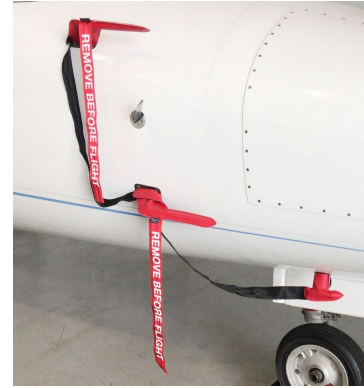
Lear 45 Pitot & Rosemont Cover Set