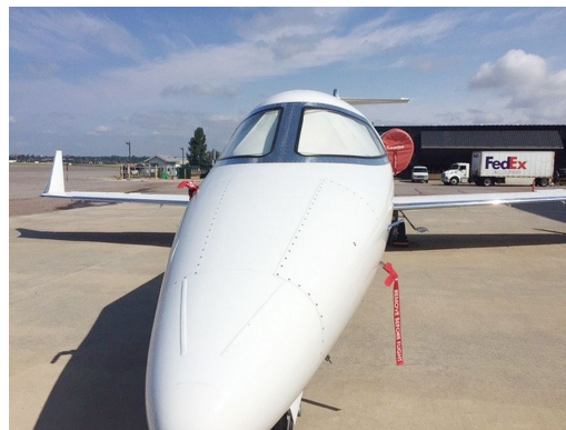
Lear Models 40 & 45 Cockpit Heatshields, Covers All Cockpit Windows

Cockpit Heatshields are interior sunshades for the aircraft's cockpit. The product is a unique composite of closed-cell foam with a silver mylar finish. The semi-rigid design is stiff enough to stand inside the window framing. The set folds up flat and is easily stored in the included storage sleeve. Some designs may require velcro and suction cups. Our Heatshields for jets are offered white side out because some aircraft manufacturers have issued advisories against reflective window inserts due to potential heat damage. A Heatshield is an excellent short-term remedy for cockpit overheating, but an external fabric cover is more effective for long-term protection.