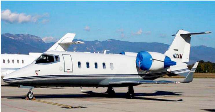
Lear 60 Engine Cover set, comes in colors

The Lear Models 70 & 75 Bikini Style Engine Covers are a single-piece design using a soft and smooth stretchy and fabric. The cover stretches tightly over both the intake and exhaust, installing quickly and easily. These covers are designed to be used as hangar dust covers and have a useful life of approximately one year.