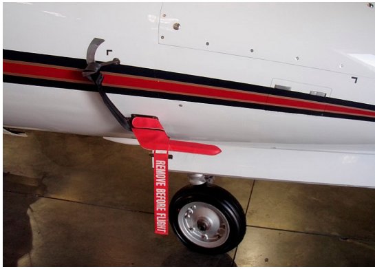
Learjet Heat Resistant Pitot Cover with AOA strap