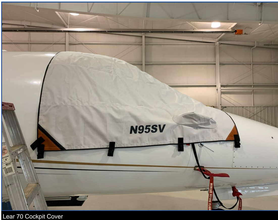
Lear 70 Cockpit Cover