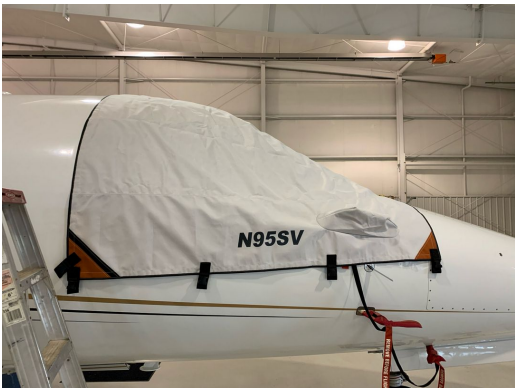
Lear 70 Cockpit Cover