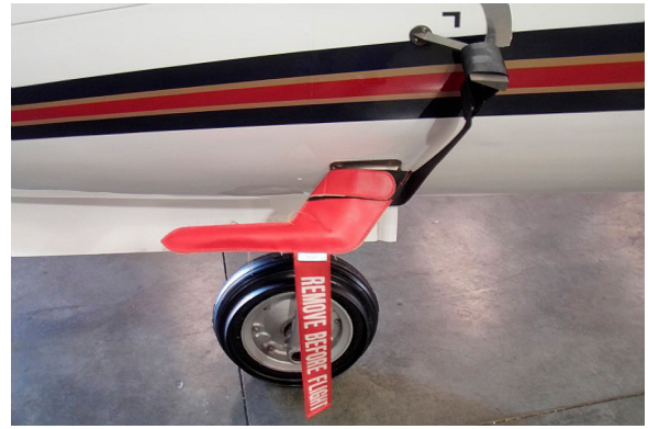
Learjet Heat Resistant Pitot Cover and AOA Strap