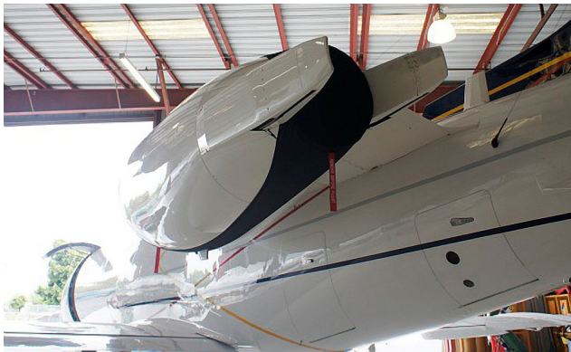
Lear 60 "Bikini Style" Engine Covers

The Lear 85 Bikini Style Engine Covers are a single-piece design using a soft and smooth stretchy and fabric. The cover stretches tightly over both the intake and exhaust, installing quickly and easily. These covers are designed to be used as hangar dust covers and have a useful life of approximately one year.