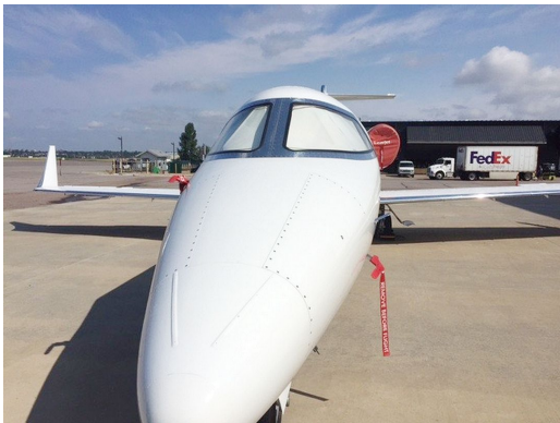
Lear Models 40 & 45 Cockpit Heatshields, Covers All Cockpit Windows

Cockpit Heatshields are interior sunshades for the aircraft's cockpit. The product is a unique composite of closed-cell foam with a silver mylar finish. The semi-rigid design is stiff enough to stand inside the window framing. The set folds up flat and is easily stored in the included storage sleeve. Some designs may require velcro and suction cups. Our Heatshields for jets are offered white side out because some aircraft manufacturers have issued advisories against reflective window inserts due to potential heat damage. A Heatshield is an excellent short-term remedy for cockpit overheating, but an external fabric cover is more effective for long-term protection.