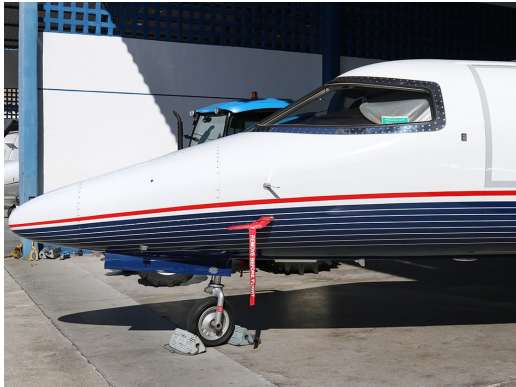
Lear Pitot Cover