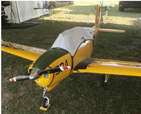
Beechcraft T-34B Mentor Canopy Cover, for 36% Scale Model