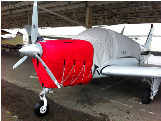
Beech Bonanza Insulated Engine Cover, fully enclosed

This cover type is made from Silver Acrylic Sunbrella canvas and is 100% lined with a soft and smooth microfiber. Bruce's Custom Covers developed this material combination especially for aircraft protection. The outer material is medium weight and treated for water resistance, UV resistance and anti-static buildup. The inner lining is a very soft and smooth microfiber to prevent scratching. The material is very reflective, and tests show that the cabin interior temperature can be reduced to near-ambient temperature on the hottest of days. It is water, ice and snow repellent, yet breathable to allow moisture to escape from between the cover and the aircraft surface.