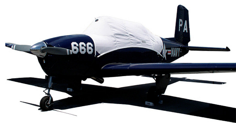
The T34 Canopy Cover

Travel Covers are made with Silver Solution-Dyed Polyester fabric and only lined over the windshield to save weight. The material is lightweight and more compact for easy stowage in the aircraft. The polyester material is water resistant, but only intended for occasional use outside. We also have an ultra lightweight material available for fitted hangar dust covers. For daily outdoor use, the non-travel Sunbrella Cover is the best choice.