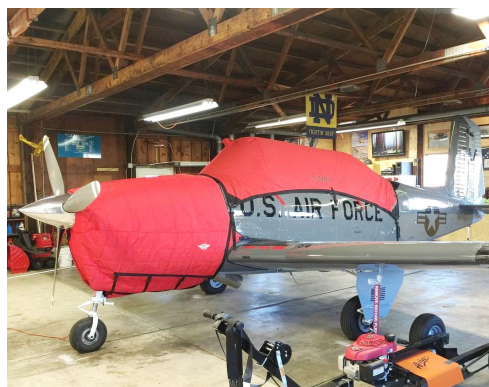
Beech T34 Mentor Canopy Cover, Insulated Engine Cover