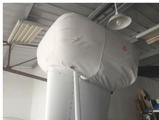
Lake LA-4 Buccaneer Engine Cover