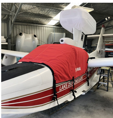
Lake LA250 Renegade Cockpit Cover, Engine Cover (test fit)

This cover type is made from Silver Acrylic Sunbrella canvas and is 100% lined with a soft and smooth microfiber. Bruce's Custom Covers developed this material combination especially for aircraft protection. The outer material is medium weight and treated for water resistance, UV resistance and anti-static buildup. The inner lining is a very soft and smooth microfiber to prevent scratching. The material is very reflective, and tests show that the cabin interior temperature can be reduced to near-ambient temperature on the hottest of days. It is water, ice and snow repellent, yet breathable to allow moisture to escape from between the cover and the aircraft surface.