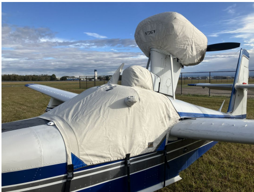
Lake LA-4 Canopy/Heater Box Cover, Engine Cover