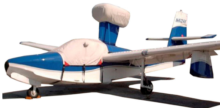
Lake Canopy & Engine Covers