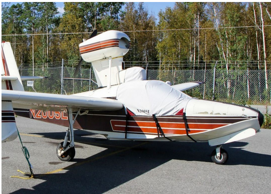
Lake LA4 Canopy Cover with Heater Box

This cover type is made from Silver Acrylic Sunbrella canvas and is 100% lined with a soft and smooth microfiber. Bruce's Custom Covers developed this material combination especially for aircraft protection. The outer material is medium weight and treated for water resistance, UV resistance and anti-static buildup. The inner lining is a very soft and smooth microfiber to prevent scratching. The material is very reflective, and tests show that the cabin interior temperature can be reduced to near-ambient temperature on the hottest of days. It is water, ice and snow repellent, yet breathable to allow moisture to escape from between the cover and the aircraft surface.