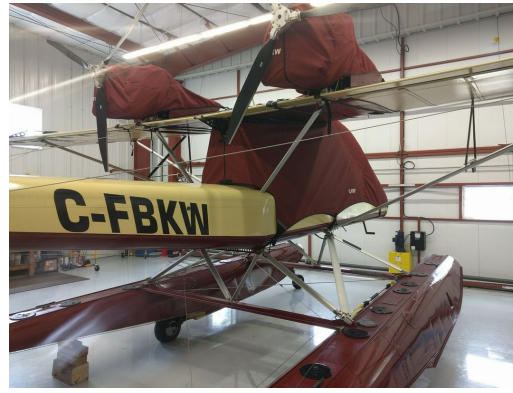
Lockwood Air Cam Canopy Cover, enclosed cockpit style, & Engine Covers