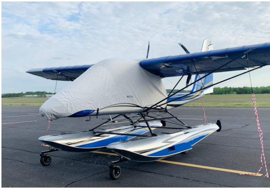
Lockwood AirCam Travel Weight Canopy/Nose/Baggage Area Cover