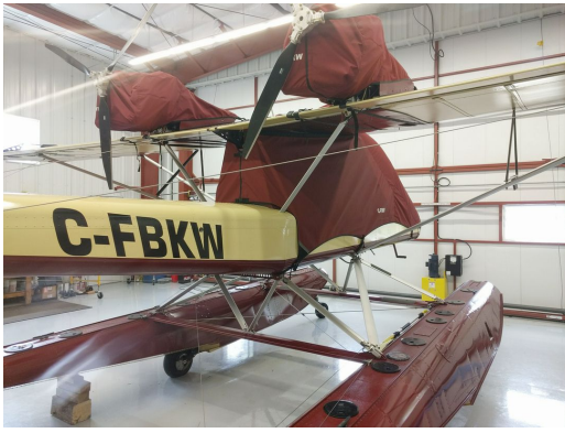
Lockwood Aircam Canopy Cover (fully enclosed bubble), Engine Covers