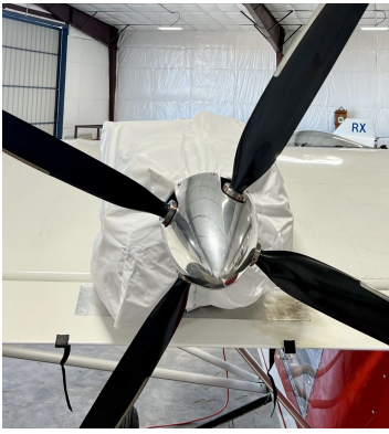
Lockwood Air Cam Engine Cover, test fit cover