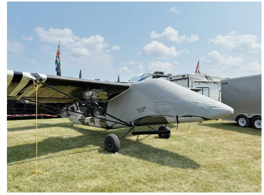
Lockwood AirCam Light Weight Travel Cover