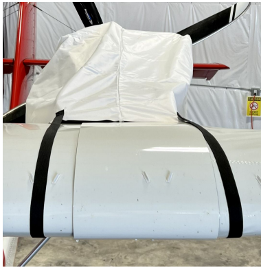
Lockwood Air Cam Engine Cover, test fit cover