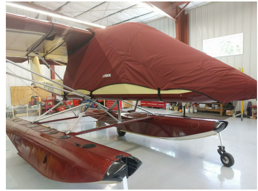
Lockwood AirCam Canopy/Nose/Baggage Area Cover (3D model)