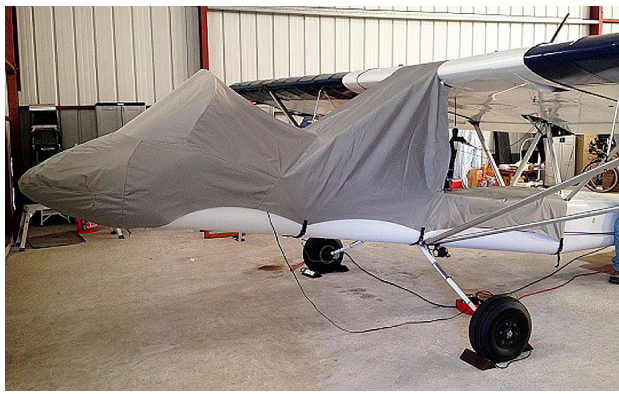
Lockwood AirCam Lightweight Travel Canopy/Nose Cover w/ aft baggage compartment ext