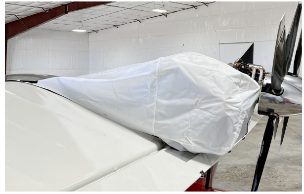
Lockwood Air Cam Engine Cover, test fit cover