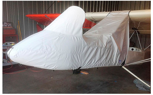
Lockwood AirCam Canopy/Nose Cover