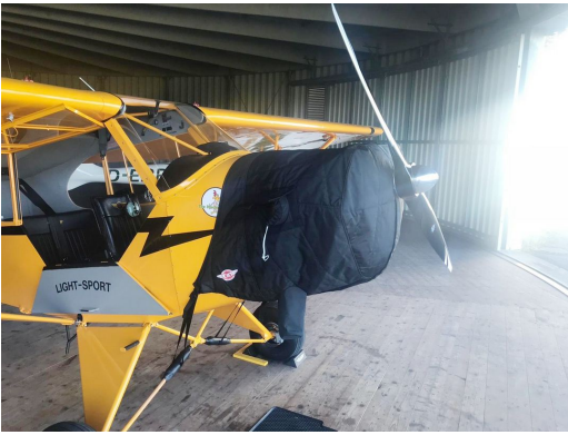
Legend Cub AL3 Insulated Engine Cover with special preheater access vent and attachment detail and fully enclosed under cowling.