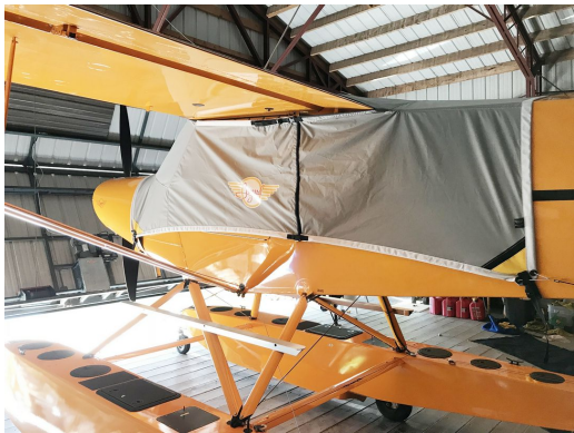
Legend Cub Light Weight Travel Cover