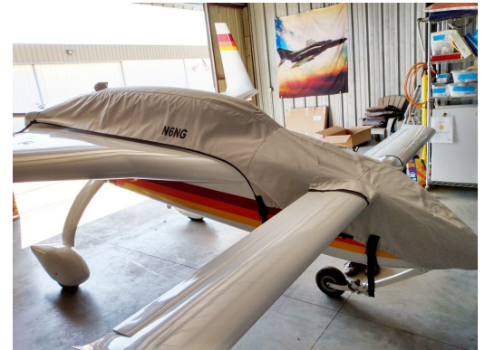
Rutan Long-EZ Canopy/Nose Cover