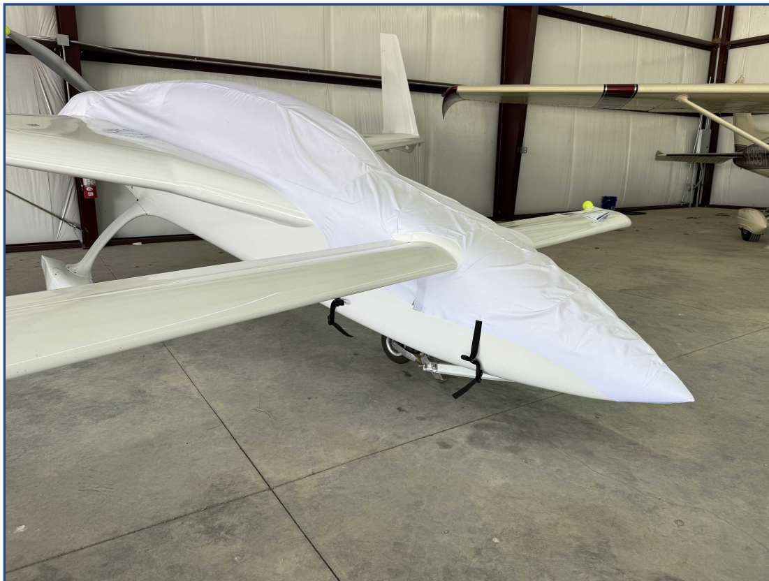
Rutan Long EZ (Saco II) Canopy/Nose/Engine Cover, test fit cover