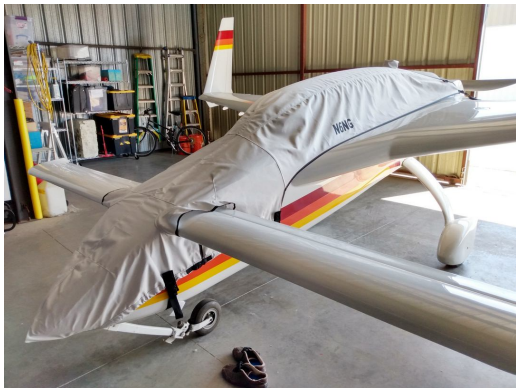
Rutan Long-EZ Canopy/Nose Cover