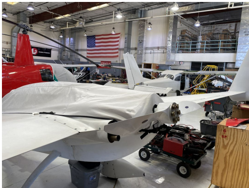
Rutan Long-EZ Canopy/Nose/Engine Cover

This cover type is made from Silver Acrylic Sunbrella canvas and is 100% lined with a soft and smooth microfiber. Bruce's Custom Covers developed this material combination especially for aircraft protection. The outer material is medium weight and treated for water resistance, UV resistance and anti-static buildup. The inner lining is a very soft and smooth microfiber to prevent scratching. The material is very reflective, and tests show that the cabin interior temperature can be reduced to near-ambient temperature on the hottest of days. It is water, ice and snow repellent, yet breathable to allow moisture to escape from between the cover and the aircraft surface.