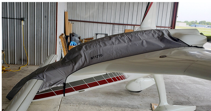
Rutan Long-EZ &amp; Berkut Travel Cover, Light Weight Canopy/Nose Cover