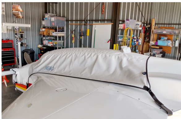
Rutan Long-EZ Canopy/Nose Cover

Travel Covers are made with Silver Solution-Dyed Polyester fabric and only lined over the windshield to save weight. The material is lightweight and more compact for easy stowage in the aircraft. The polyester material is water resistant, but only intended for occasional use outside. We also have an ultra lightweight material available for fitted hangar dust covers. For daily outdoor use, the non-travel Sunbrella Cover is the best choice.