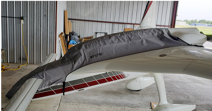
Rutan Long-EZ & Berkut Travel Cover, Light Weight Canopy/Nose Cover

Travel Covers are made with Silver Solution-Dyed Polyester fabric and only lined over the windshield to save weight. The material is lightweight and more compact for easy stowage in the aircraft. The polyester material is water resistant, but only intended for occasional use outside. We also have an ultra lightweight material available for fitted hangar dust covers. For daily outdoor use, the non-travel Sunbrella Cover is the best choice.