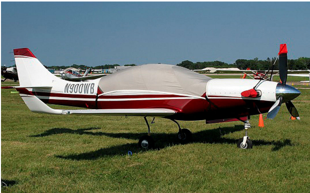
Lancair IV Canopy Cover & Prop Tie/Exhaust Cover

This cover type is made from Silver Acrylic Sunbrella canvas and is 100% lined with a soft and smooth microfiber. Bruce's Custom Covers developed this material combination especially for aircraft protection. The outer material is medium weight and treated for water resistance, UV resistance and anti-static buildup. The inner lining is a very soft and smooth microfiber to prevent scratching. The material is very reflective, and tests show that the cabin interior temperature can be reduced to near-ambient temperature on the hottest of days. It is water, ice and snow repellent, yet breathable to allow moisture to escape from between the cover and the aircraft surface.