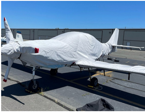
Lancair IV Complete Cover Set