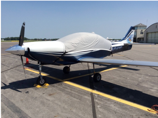
Lancair IV Light Weight Travel Canopy Cover