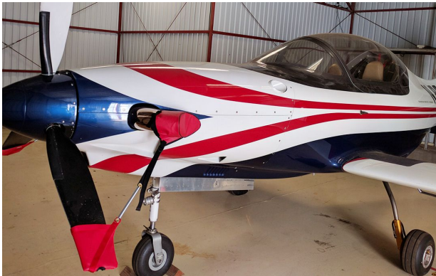
Lancair IV Prop Tie/Exhaust Covers

This cover type is made from Silver Acrylic Sunbrella canvas and is 100% lined with a soft and smooth microfiber. Bruce's Custom Covers developed this material combination especially for aircraft protection. The outer material is medium weight and treated for water resistance, UV resistance and anti-static buildup. The inner lining is a very soft and smooth microfiber to prevent scratching. The material is very reflective, and tests show that the cabin interior temperature can be reduced to near-ambient temperature on the hottest of days. It is water, ice and snow repellent, yet breathable to allow moisture to escape from between the cover and the aircraft surface.