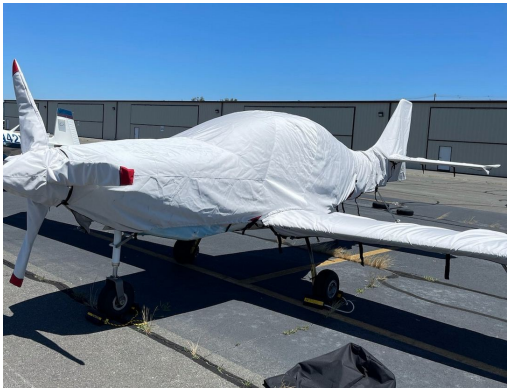
Lancair IV Complete Cover Set