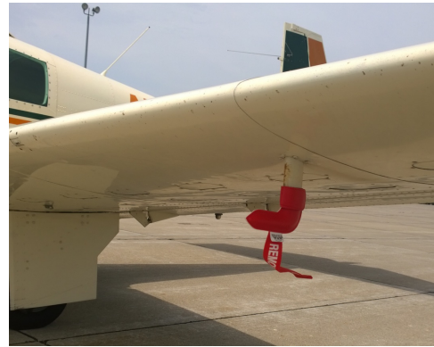
Mooney Pitot Cover