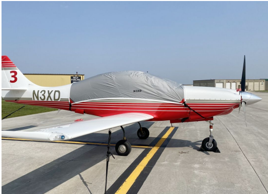
Lancair IV Travel Weight Canopy Cover

Travel Covers are made with Silver Solution-Dyed Polyester fabric and only lined over the windshield to save weight. The material is lightweight and more compact for easy stowage in the aircraft. The polyester material is water resistant, but only intended for occasional use outside. We also have an ultra lightweight material available for fitted hangar dust covers. For daily outdoor use, the non-travel Sunbrella Cover is the best choice.