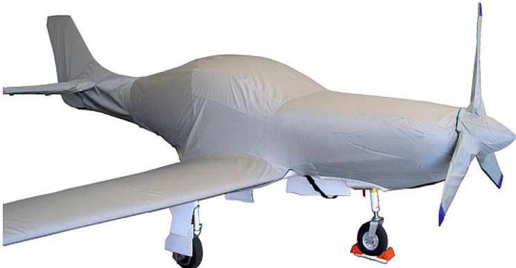
Lancair 320 Complete Fuselage/Wing Cover & Prop Cover