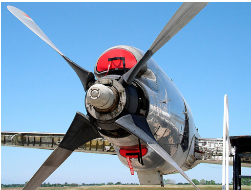
Lockheed P-3 Main Engine Inlet Plugs

Engine Inlet Plugs are custom fit for your Lockheed P-3 Orion intakes, made with heavy-duty vinyl material, and stuffed with a single block of sculpted urethane foam. Each plug has a zipper that allows the foam to be removed and dried if necessary. Engine plugs have warning flags that are visible from the cockpit or 'remove before flight' streamers sewn onto the face of the plugs. Most plugs are imprinted with the aircraft registration number in black for an extra charge. Storage bag NOT included. Engine plugs may be inserted after flight when the engine is still warm. Engine Inlet Plugs are commonly referred to as Cowl Plugs, Intake Plugs, Cowl Blocks, Engine Blocks, and Engine Bungs.