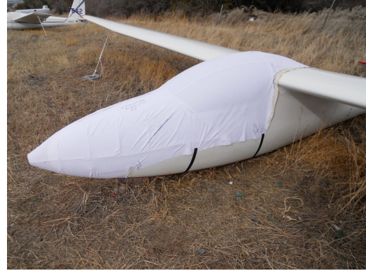
Laister LP-49 Canopy/Nose Cover, test fit cover