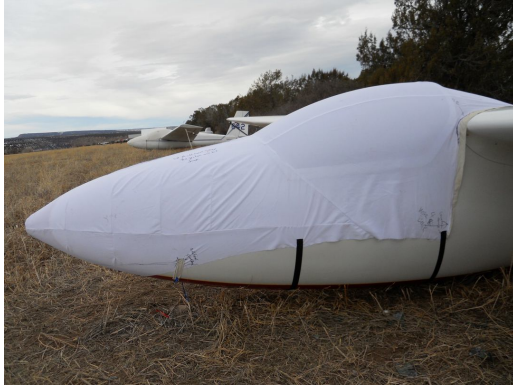
Laister LP-49 Canopy/Nose Cover, test fit cover

water resistance, UV resistance and anti-static buildup. The inner lining is a very soft and smooth microfiber to prevent scratching. The material is very reflective, and tests show that the cabin interior temperature can be reduced to near-ambient temperature on the hottest of days. It is water, ice and snow repellent, yet breathable to allow moisture to escape from between the cover and the aircraft surface.