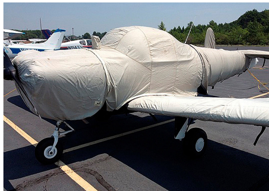
Ercoupe full cover set: Extended Canopy, Engine, Wing & Empennage covers

WINTER USE MATERIAL - Made with Solution-Dyed Polyester fabric, this option is intended for seasonal use to aid in deicing, rain mitigation, or for occasional travel. The material is lighter and more compact, but more susceptible to UV damage and may have a shorter useful life if used continuously outside than the all-year use material.