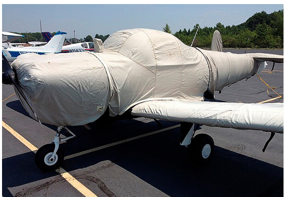
Ercoupe full cover set: Extended Canopy, Engine, Wing & Empennage covers

This cover type is made from Silver Acrylic Sunbrella canvas and is 100% lined with a soft and smooth microfiber. Bruce's Custom Covers developed this material combination especially for aircraft protection. The outer material is medium weight and treated for water resistance, UV resistance and anti-static buildup. The inner lining is a very soft and smooth microfiber to prevent scratching. The material is very reflective, and tests show that the cabin interior temperature can be reduced to near-ambient temperature on the hottest of days. It is water, ice and snow repellent, yet breathable to allow moisture to escape from between the cover and the aircraft surface.