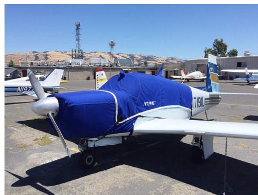
Mooney M20 Canopy & Engine Cover