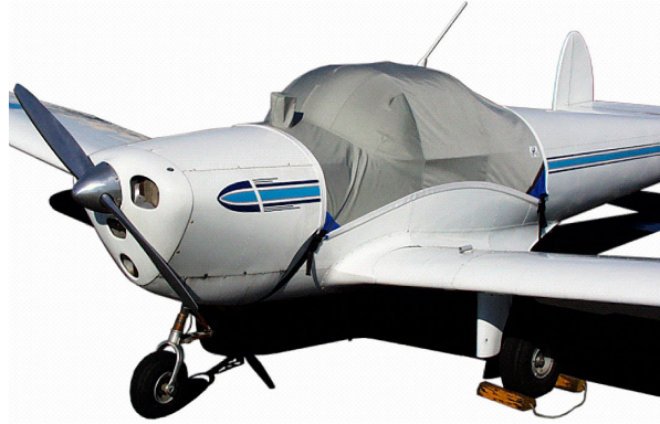
Ercoupe Canopy Cover, bubble windshield model

Travel Covers are made with Silver Solution-Dyed Polyester fabric and only lined over the windshield to save weight. The material is lightweight and more compact for easy stowage in the aircraft. The polyester material is water resistant, but only intended for occasional use outside. We also have an ultra lightweight material available for fitted hangar dust covers. For daily outdoor use, the non-travel Sunbrella Cover is the best choice.