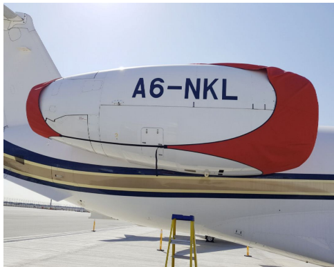
Embraer ERJ-135/140/145 Legacy 650 3-Strap Intake/Exhaust Cover

The Embraer ERJ-135/140/145 Legacy 600, 650 Intake Covers are designed to install easily yet be completely storable. A spring steel hoop is sewn into the hem of each cover, allowing them to be installed without climbing onto the wing or using a stepladder. To store the covers the spring steel hoop folds like a band-saw blade into three nesting rings. Each cover folds into a compact circular bundle which is stored in the included duffle bag, yet they unfold quickly for use. The Tri-Fold Ring cover is made of medium weight nylon which is available in a variety of colors to match the paint trim. Each cover set comes complete with installation and folding instructions. The aircraft's registration number can be silkscreened onto the cover for an extra charge.