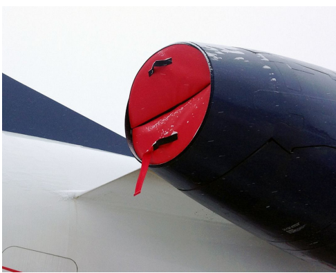
Embraer Legacy 650 Exhaust Plug

The Engine Inlet Plugs are custom fit for your Embraer ERJ-135/140/145 Legacy 600, 650 intakes, made with heavy-duty vinyl material, and stuffed with a single block of sculpted urethane foam. Each plug has a zipper that allows the foam to be removed and dried if necessary. Engine plugs have 'remove before flight' streamers sewn onto the face of the plugs. Most plugs are imprinted with the aircraft registration number in black for an extra charge. Storage bag NOT included. Engine plugs may be inserted after flight when the engine is still warm. Engine Inlet Plugs are commonly referred to as Cowl Plugs, Intake Plugs, Cowl Blocks, Engine Blocks, and Engine Bungs.