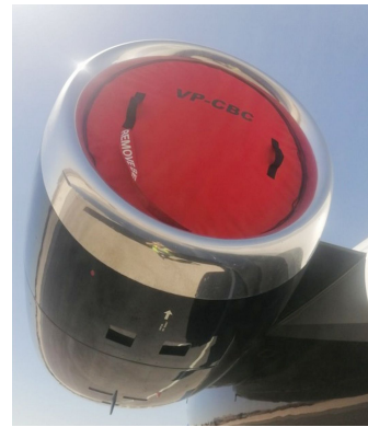
Embraer ERJ-135/140/145 Legacy 600, 650, Praetor Intake/Exhaust Plugs, Non-Folding Type