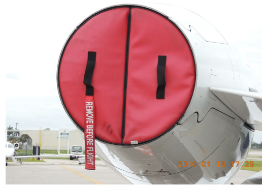
Embraer Legacy 500 Engine Exhaust Plug, folding type