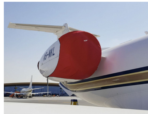
Embraer ERJ-135/140/145 Legacy 650 3-Strap Intake/Exhaust Cover