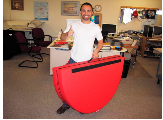
Boeing 737 FOD protection Intake Plug, folding type