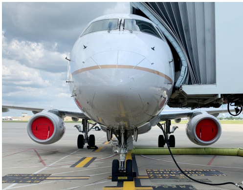
Embraer EMB-170/175 Engine Inlet Plugs

The Engine Inlet Plugs are custom fit for your Embraer EMB-170/175 intakes, made with heavy-duty vinyl material, and stuffed with a single block of sculpted urethane foam. Each plug has a zipper that allows the foam to be removed and dried if necessary. Engine plugs have 'remove before flight' streamers sewn onto the face of the plugs. Most plugs are imprinted with the aircraft registration number in black for an extra charge. Storage bag NOT included. Engine plugs may be inserted after flight when the engine is still warm. Engine Inlet Plugs are commonly referred to as Cowl Plugs, Intake Plugs, Cowl Blocks, Engine Blocks, and Engine Bungs.