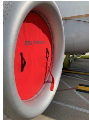
Embraer EMB-170/175 Engine Inlet Plugs