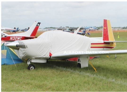
Mooney M20C Extended Canopy/Engine Cover

This cover type is made from Silver Acrylic Sunbrella canvas and is 100% lined with a soft and smooth microfiber. Bruce's Custom Covers developed this material combination especially for aircraft protection. The outer material is medium weight and treated for water resistance, UV resistance and anti-static buildup. The inner lining is a very soft and smooth microfiber to prevent scratching. The material is very reflective, and tests show that the cabin interior temperature can be reduced to near-ambient temperature on the hottest of days. It is water, ice and snow repellent, yet breathable to allow moisture to escape from between the cover and the aircraft surface.