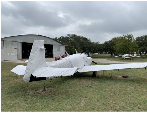
Mooney M20M Bravo Cover Set