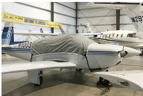
Mooney 201 Travel Cover, Light Weight Travel Canopy Cover, 5 Lbs