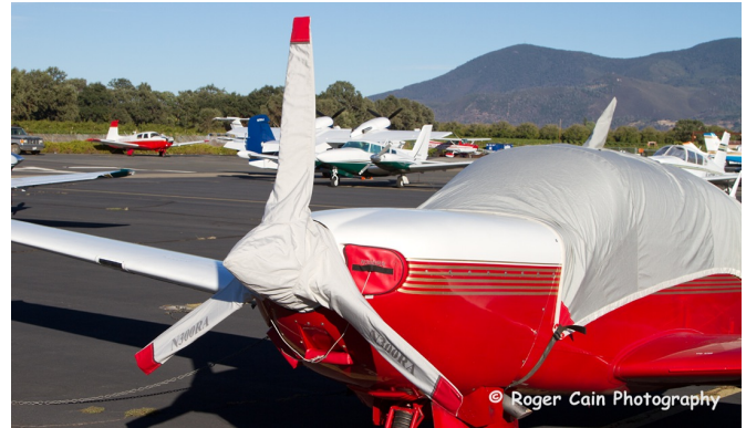
Mooney M20M Bravo 3-Blade Prop Cover, Engine Plugs