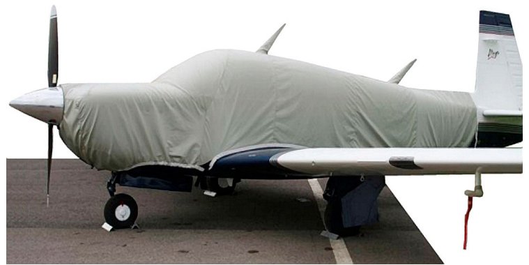
Mooney M20 Extra Extended Canopy/Engine Cover