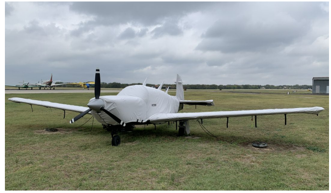
Mooney M20M Bravo Cover Set