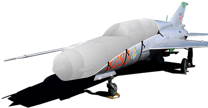
Mig 21 Canopy/Nose Cover

This cover type is made from Silver Acrylic Sunbrella canvas and is 100% lined with a soft and smooth microfiber. Bruce's Custom Covers developed this material combination especially for aircraft protection. The outer material is medium weight and treated for water resistance, UV resistance and anti-static buildup. The inner lining is a very soft and smooth microfiber to prevent scratching. The material is very reflective, and tests show that the cabin interior temperature can be reduced to near-ambient temperature on the hottest of days. It is water, ice and snow repellent, yet breathable to allow moisture to escape from between the cover and the aircraft surface.