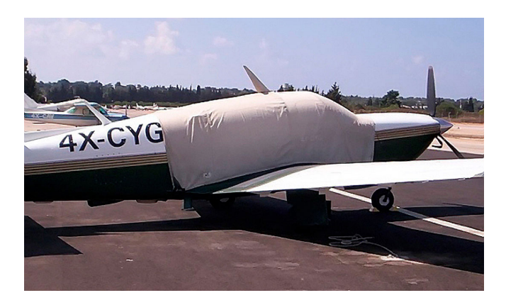
Mooney M20 Extended Canopy Cover