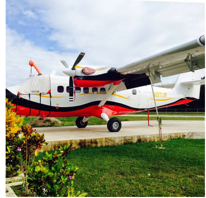
Twin Otter Cockpit Cover & Engine Plugs