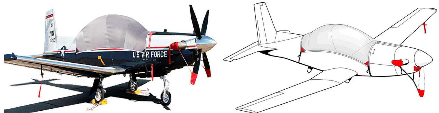
Texan II T6A Canopy Cover, Engine Inlet Plug, Prop Tie/Exhaust Covers, Pitot Cover Pilatus PC-9 Canopy Cover, Prop Tie-Down, Engine Plug, Pitot Cover

Travel Covers are made with Silver Solution-Dyed Polyester fabric and only lined over the windshield to save weight. The material is lightweight and more compact for easy stowage in the aircraft. The polyester material is water resistant, but only intended for occasional use outside. We also have an ultra lightweight material available for fitted hangar dust covers. For daily outdoor use, the non-travel Sunbrella Cover is the best choice.