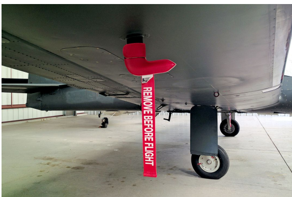
Embraer EMB 312 Tucano Pitot Covers

Engine Inlet Plugs are custom fit for your Embraer EMB 312 Tucano, T-27 intakes, made with heavy-duty vinyl material, and stuffed with a single block of sculpted urethane foam. Each plug has a zipper that allows the foam to be removed and dried if necessary. Engine plugs have warning flags that are visible from the cockpit or 'remove before flight' streamers sewn onto the face of the plugs. Most plugs are imprinted with the aircraft registration number in black for an extra charge. Storage bag NOT included. Engine plugs may be inserted after flight when the engine is still warm. Engine Inlet Plugs are commonly referred to as Cowl Plugs, Intake Plugs, Cowl Blocks, Engine Blocks, and Engine Bungs.