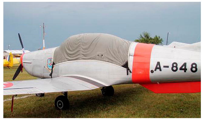
Pilatus P-3 Canopy Cover