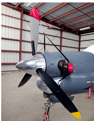
Embraer EMB 312 Tucano Prop Tie Down/Exhaust Covers