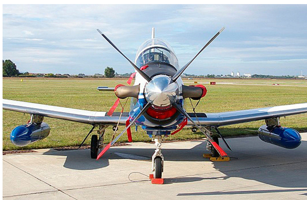
Texan II T6A Engine Inlet Plug, Prop Tie/Exhaust Covers