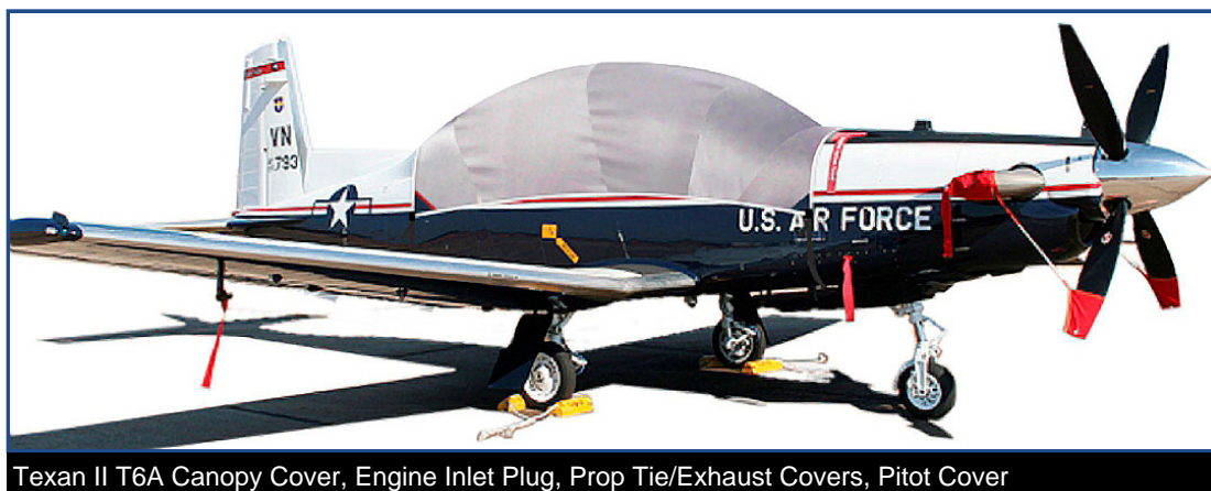
Texan II T6A Canopy Cover, Engine Inlet Plug, Prop Tie/Exhaust Covers, Pitot Cover