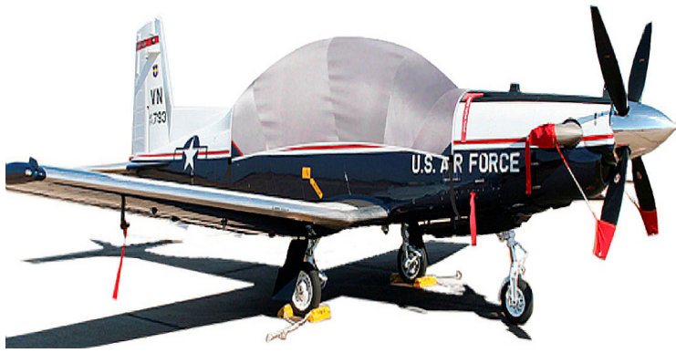
Texan II T6A Canopy Cover, Engine Inlet Plug, Prop Tie/Exhaust Covers, Pitot Cover