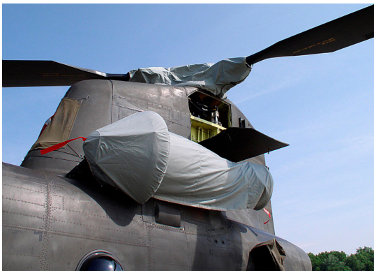
Boeing Vertol CH-47 Engine and Rotor Hub Covers

Insulated Covers Material - A special composite material of solution-dyed polyester, 3M Thinsulate insulation, and soft nylon interior fabric. Our insulated covers are designed to complement an engine preheater and help retain heat in the engine compartment after shutdown. If you operate your aircraft in cold-weather, these covers will help prevent engine wear and tear.