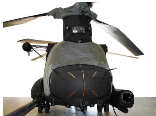
Boeing Vertol CH-47 Forward Cabin & Rotor Hub Cover