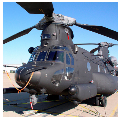
Boeing Vertol MH-47 Rotor Hubs, Engine & Other Covers