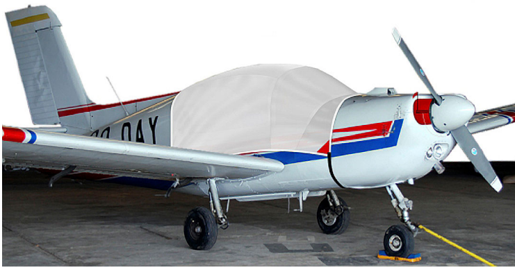
Standard Canopy Cover for MS893A