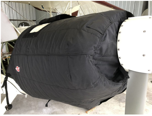
Marquardt Charger MA-5 Insulated Engine Cover