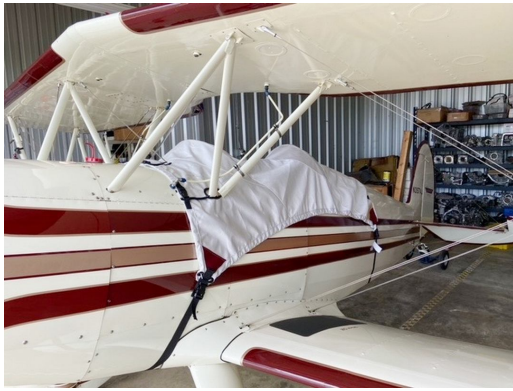
Marquardt Charger Cockpit Cover