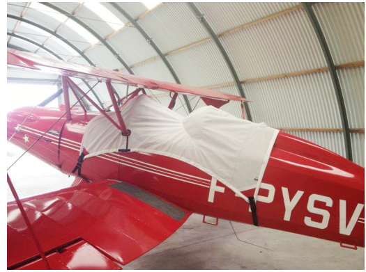
Starduster Too Canopy Cover