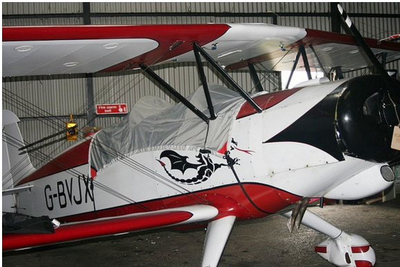
Marquardt Charger MA-5 Light Weight Travel Cockpit Cover

This cover type is made from Silver Acrylic Sunbrella canvas and is 100% lined with a soft and smooth microfiber. Bruce's Custom Covers developed this material combination especially for aircraft protection. The outer material is medium weight and treated for water resistance, UV resistance and anti-static buildup. The inner lining is a very soft and smooth microfiber to prevent scratching. The material is very reflective, and tests show that the cabin interior temperature can be reduced to near-ambient temperature on the hottest of days. It is water, ice and snow repellent, yet breathable to allow moisture to escape from between the cover and the aircraft surface.