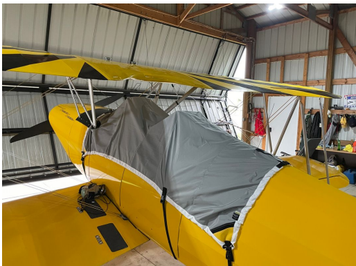
Marquardt Charger Travel Weight Canopy Cover

This cover type is made from Silver Acrylic Sunbrella canvas and is 100% lined with a soft and smooth microfiber. Bruce's Custom Covers developed this material combination especially for aircraft protection. The outer material is medium weight and treated for water resistance, UV resistance and anti-static buildup. The inner lining is a very soft and smooth microfiber to prevent scratching. The material is very reflective, and tests show that the cabin interior temperature can be reduced to near-ambient temperature on the hottest of days. It is water, ice and snow repellent, yet breathable to allow moisture to escape from between the cover and the aircraft surface.