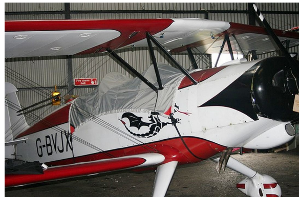
Marquardt Charger MA-5 Light Weight Travel Cockpit Cover