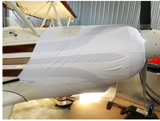
Marquardt Charger Insulated Engine Cover (test fit cover_