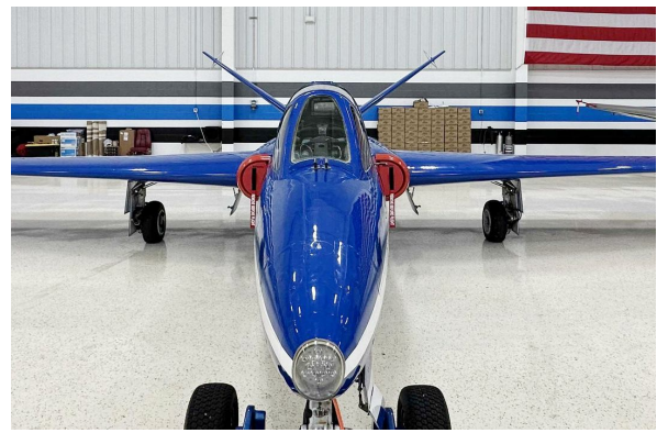
Fouga Magister CM170 Intake Plugs