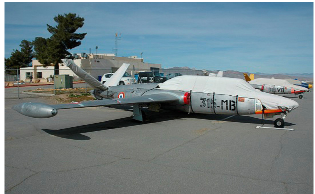
Fouga Magister Canopy/Nose Cover & Tail Stabilizer Covers