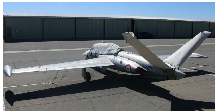
Fouga Magister Canopy/Nose Cover, Tail Stabilizer Covers