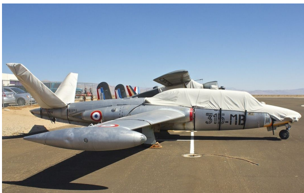
Fouga Magister Canopy/Nose Cover, Tail Stabilizer Covers

WINTER USE MATERIAL - Made with Solution-Dyed Polyester fabric, this option is intended for seasonal use to aid in deicing, rain mitigation, or for occasional travel. The material is lighter and more compact, but more susceptible to UV damage and may have a shorter useful life if used continuously outside than the all-year use material.