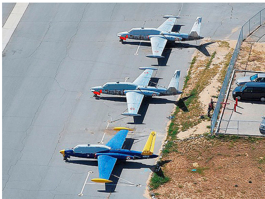
Fouga Magister Canopy Cover, Canopy/Nose Covers and Tail Stabilizer Covers

This cover type is made from Silver Acrylic Sunbrella canvas and is 100% lined with a soft and smooth microfiber. Bruce's Custom Covers developed this material combination especially for aircraft protection. The outer material is medium weight and treated for water resistance, UV resistance and anti-static buildup. The inner lining is a very soft and smooth microfiber to prevent scratching. The material is very reflective, and tests show that the cabin interior temperature can be reduced to near-ambient temperature on the hottest of days. It is water, ice and snow repellent, yet breathable to allow moisture to escape from between the cover and the aircraft surface.