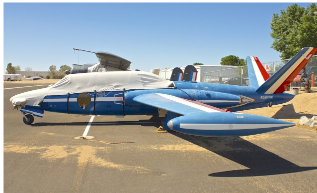
Fouga Magister Canopy/Nose Cover