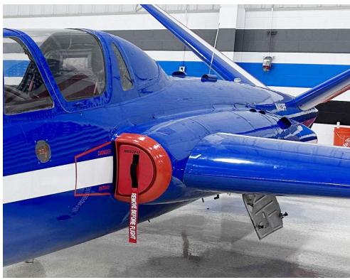
Fouga Magister CM170 Intake Plugs