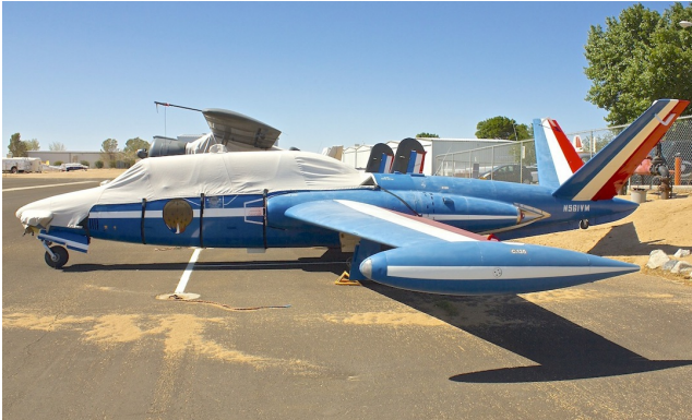
Fouga Magister Canopy/Nose Cover

This cover type is made from Silver Acrylic Sunbrella canvas and is 100% lined with a soft and smooth microfiber. Bruce's Custom Covers developed this material combination especially for aircraft protection. The outer material is medium weight and treated for water resistance, UV resistance and anti-static buildup. The inner lining is a very soft and smooth microfiber to prevent scratching. The material is very reflective, and tests show that the cabin interior temperature can be reduced to near-ambient temperature on the hottest of days. It is water, ice and snow repellent, yet breathable to allow moisture to escape from between the cover and the aircraft surface.