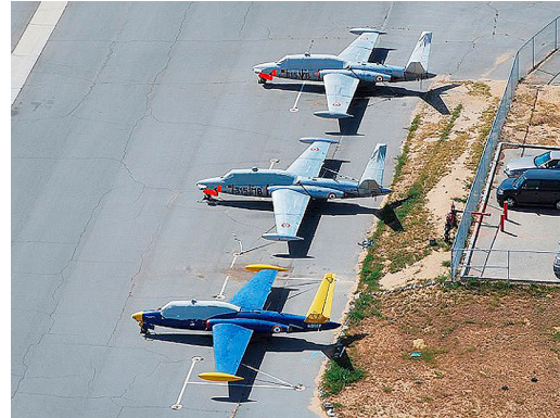
Fouga Magister Canopy Cover, Canopy/Nose Covers and Tail Stabilizer Covers