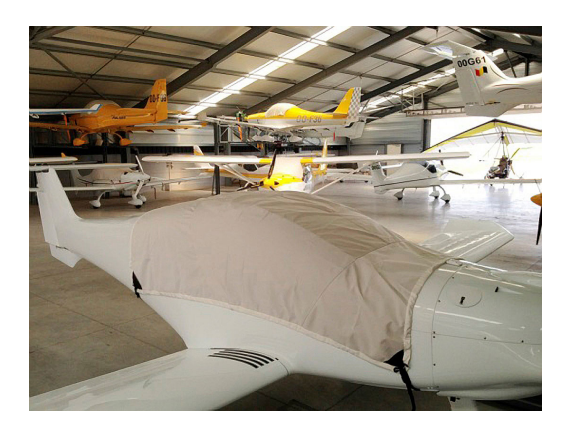
Dynaero MCR Pickup Canopy Cover