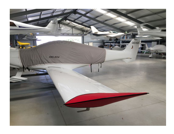
Dynaero MCR.4 Pickup Canopy Cover, Wingtip Pads