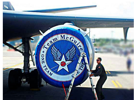
McDonnell Douglas KC-10 Intake Cover