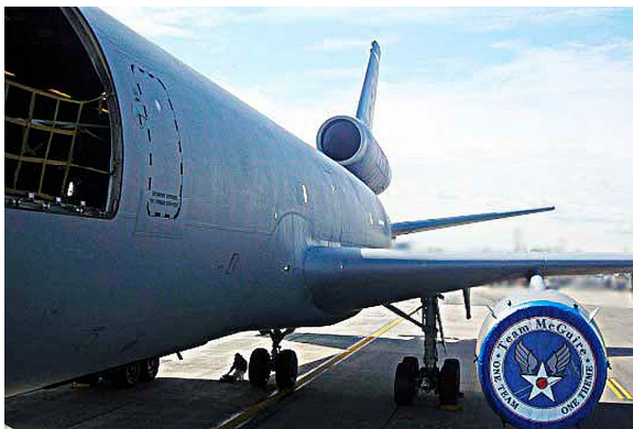
KC-10 Intake Cover at McGuire AFB, NJ