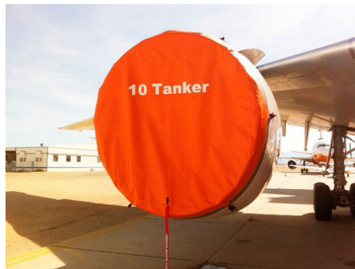
DC-10 Intake Cover