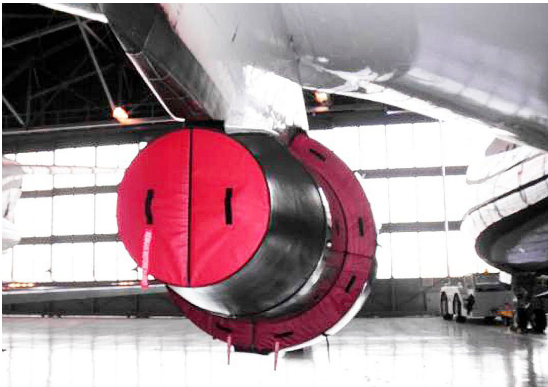
DC-10 Bypass Vent, Exhaust Plug set Exhaust Plugs Ship Set, incl. Fan Thrust Reverser and Exhaust Plugs P/N: B767-200