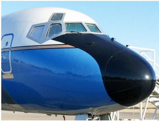
McDonnell Douglas MD80 Cockpit Heatshield Set