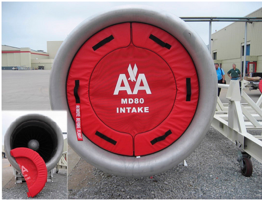
MD-80 JT8D Intake Plug, mesh center & folding type