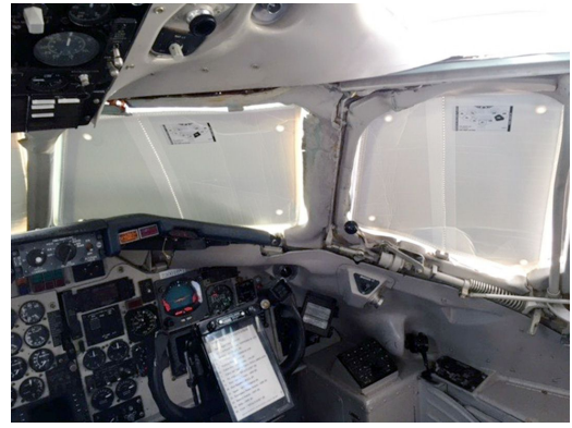
McDonnell Douglas MD80 Cockpit Heatshield Set