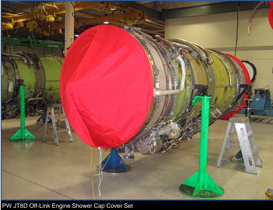
PW JT8D Off-Link Engine Shower Cap Cover Set