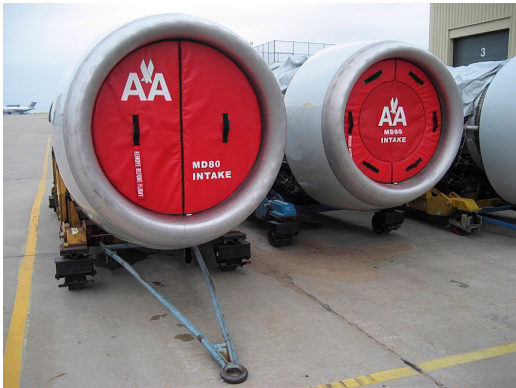
Static Port & Small Inlet/Vent Adhesive Covers: Ideal for Wash Prep and Maintenance MD-80 JT8D Intake Plugs, Solid Foam folding type& Mesh Center folding type