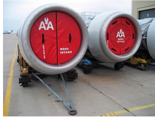
PW JT8D Off-Link Engine Shower Cap Cover Set MD-80 JT8D Intake Plugs, Solid Foam folding type& Mesh Center folding type