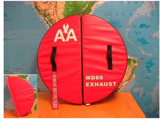
MD-80 Exhaust Plug, folding type