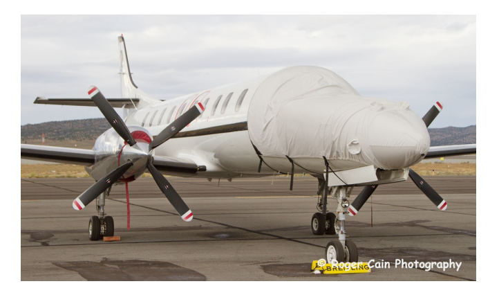
Merlin Cockpit/Nose Cover