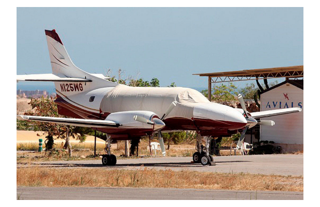
Merlin Canopy Cover

Travel Covers are made with Silver Solution-Dyed Polyester fabric and only lined over the windshield to save weight. The material is lightweight and more compact for easy stowage in the aircraft. The polyester material is water resistant, but only intended for occasional use outside. We also have an ultra lightweight material available for fitted hangar dust covers. For daily outdoor use, the non-travel Sunbrella Cover is the best choice.