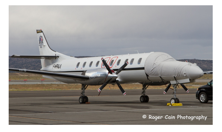
Merlin Cockpit/Nose Cover

This cover type is made from Silver Acrylic Sunbrella canvas and is 100% lined with a soft and smooth microfiber. Bruce's Custom Covers developed this material combination especially for aircraft protection. The outer material is medium weight and treated for water resistance, UV resistance and anti-static buildup. The inner lining is a very soft and smooth microfiber to prevent scratching. The material is very reflective, and tests show that the cabin interior temperature can be reduced to near-ambient temperature on the hottest of days. It is water, ice and snow repellent, yet breathable to allow moisture to escape from between the cover and the aircraft surface.