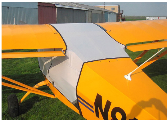
Aerotrek A240 Spandex FlyAway Travel Canopy Cover

Travel Covers are made with Silver Solution-Dyed Polyester fabric and only lined over the windshield to save weight. The material is lightweight and more compact for easy stowage in the aircraft. The polyester material is water resistant, but only intended for occasional use outside. We also have an ultra lightweight material available for fitted hangar dust covers. For daily outdoor use, the non-travel Sunbrella Cover is the best choice.