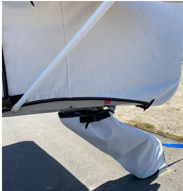
Kitfox Full Cover Set

ALL-YEAR USE MATERIAL - Made with Silver Acrylic Sunbrella canvas, the all-year use material is the best option for sun protection and cover longevity. This heavier more durable material is intended for all weather conditions, such as rain and snow or lots of sun.