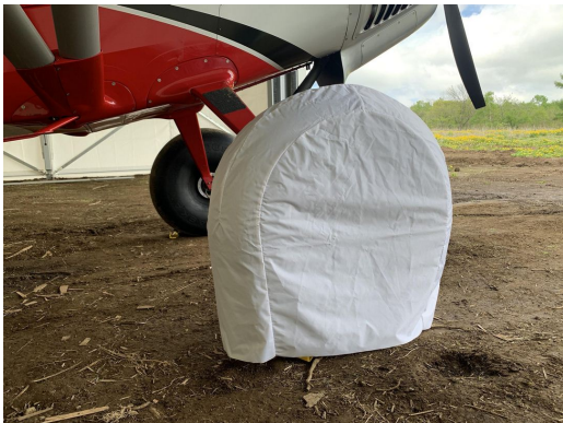
Cub Crafters CC19 Oversize Tire Covers, test fit cover

ALL-YEAR USE MATERIAL - Made with Silver Acrylic Sunbrella canvas, the all-year use material is the best option for sun protection and cover longevity. This heavier more durable material is intended for all weather conditions, such as rain and snow or lots of sun.