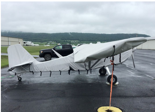
Kitfox 5 Complete Cover Set

This cover type is made from Silver Acrylic Sunbrella canvas and is 100% lined with a soft and smooth microfiber. Bruce's Custom Covers developed this material combination especially for aircraft protection. The outer material is medium weight and treated for water resistance, UV resistance and anti-static buildup. The inner lining is a very soft and smooth microfiber to prevent scratching. The material is very reflective, and tests show that the cabin interior temperature can be reduced to near-ambient temperature on the hottest of days. It is water, ice and snow repellent, yet breathable to allow moisture to escape from between the cover and the aircraft surface.