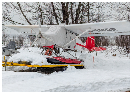
Merlin GT Extended Canopy/Engine Cover