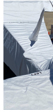
Kitfox Full Cover Set