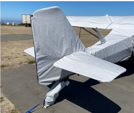
Kitfox Full Cover Set