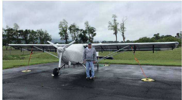
Kitfox 5 Complete Cover Set