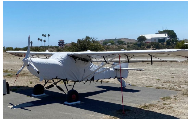
Kitfox Full Cover Set