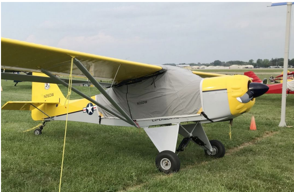
Kitfox Travel Canopy Cover

Travel Covers are made with Silver Solution-Dyed Polyester fabric and only lined over the windshield to save weight. The material is lightweight and more compact for easy stowage in the aircraft. The polyester material is water resistant, but only intended for occasional use outside. We also have an ultra lightweight material available for fitted hangar dust covers. For daily outdoor use, the non-travel Sunbrella Cover is the best choice.