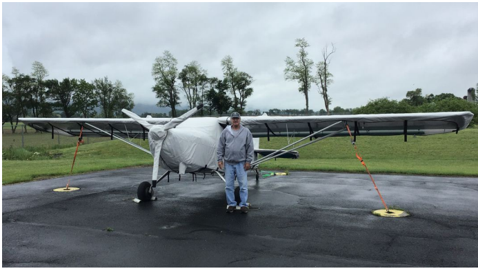
Kitfox 5 Complete Cover Set