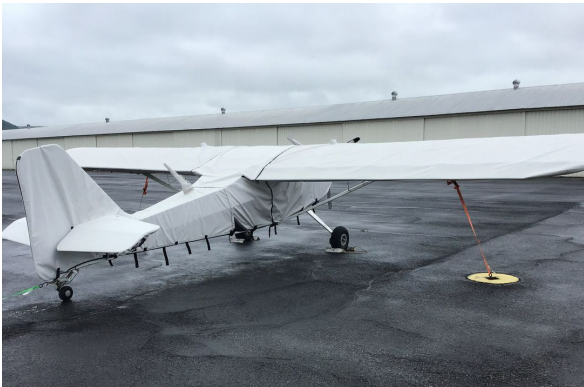
Kitfox 5 Complete Cover Set