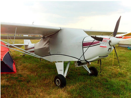
Kitfox Spandex FlyAway Travel Canopy Cover