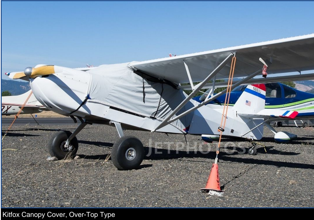
Kitfox Canopy Cover, Over-Top Type