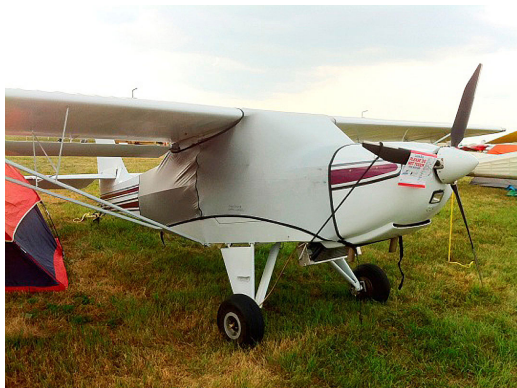
Kitfox Spandex FlyAway Travel Canopy Cover

This cover type is made from Silver Acrylic Sunbrella canvas and is 100% lined with a soft and smooth microfiber. Bruce's Custom Covers developed this material combination especially for aircraft protection. The outer material is medium weight and treated for water resistance, UV resistance and anti-static buildup. The inner lining is a very soft and smooth microfiber to prevent scratching. The material is very reflective, and tests show that the cabin interior temperature can be reduced to near-ambient temperature on the hottest of days. It is water, ice and snow repellent, yet breathable to allow moisture to escape from between the cover and the aircraft surface.