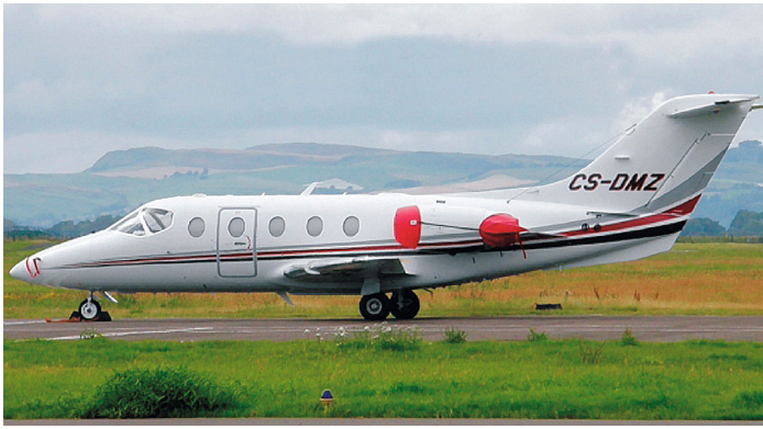
Beechjet 400 Engine & Pitot Covers