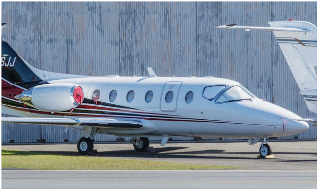
Beechjet Engine Plugs and Cockpit Heatshields