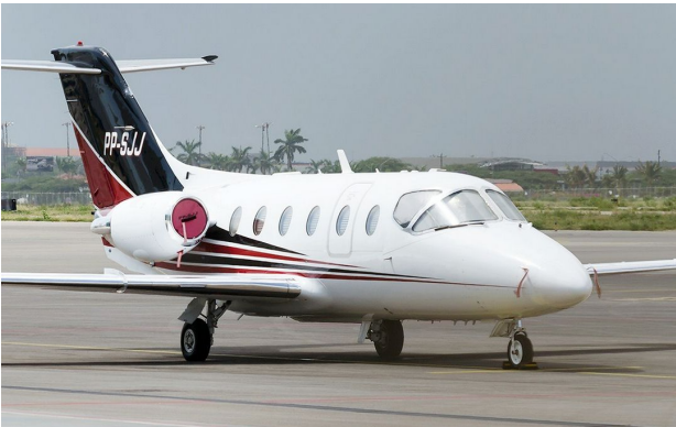
Beechjet Engine Plugs and Cockpit Heatshields

Cockpit Heatshields are interior sunshades for the aircraft's cockpit. The product is a unique composite of closed-cell foam with a silver mylar finish. The semi-rigid design is stiff enough to stand inside the window framing. The set folds up flat and is easily stored in the included storage sleeve. Some designs may require velcro and suction cups. Our Heatshields for jets are offered white side out because some aircraft manufacturers have issued advisories against reflective window inserts due to potential heat damage. A Heatshield is an excellent short-term remedy for cockpit overheating, but an external fabric cover is more effective for long-term protection.