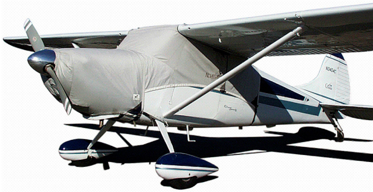
Cessna 170 Canopy Cover & Engine Cover

This cover type is made from Silver Acrylic Sunbrella canvas and is 100% lined with a soft and smooth microfiber. Bruce's Custom Covers developed this material combination especially for aircraft protection. The outer material is medium weight and treated for water resistance, UV resistance and anti-static buildup. The inner lining is a very soft and smooth microfiber to prevent scratching. The material is very reflective, and tests show that the cabin interior temperature can be reduced to near-ambient temperature on the hottest of days. It is water, ice and snow repellent, yet breathable to allow moisture to escape from between the cover and the aircraft surface.