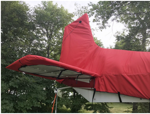
Cessna 185 Empennage Cover