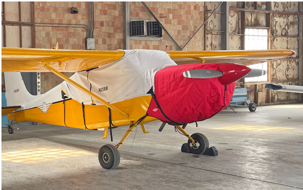
Murphy Super Rebel Insulated Engine Cover