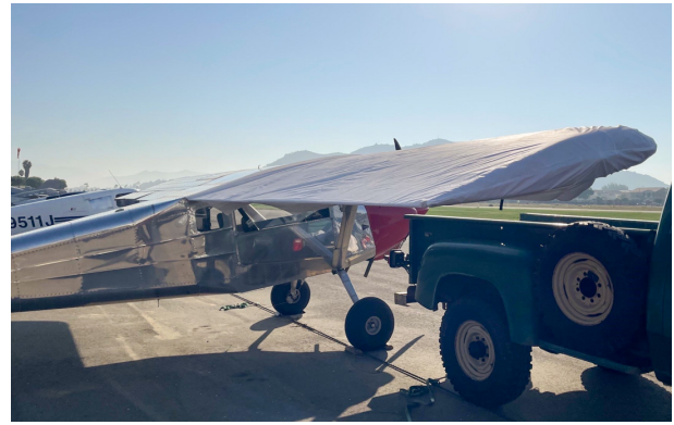
Murphy Elite Wing Covers, test fit cover