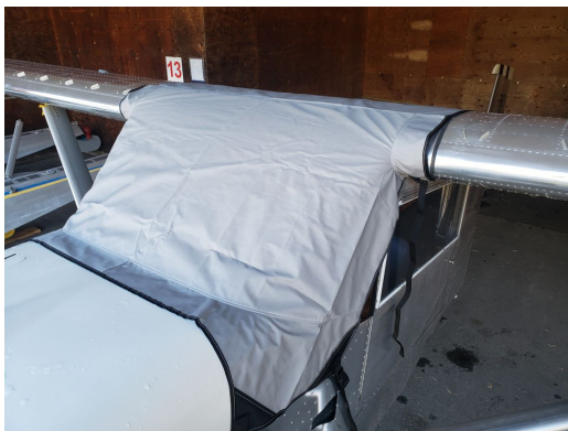
Murphy Rebel, Moose, Renegade, Spirit, Elite, etc. Windshield/Skylight Cover

This cover type is made from Silver Acrylic Sunbrella canvas and is 100% lined with a soft and smooth microfiber. Bruce's Custom Covers developed this material combination especially for aircraft protection. The outer material is medium weight and treated for water resistance, UV resistance and anti-static buildup. The inner lining is a very soft and smooth microfiber to prevent scratching. The material is very reflective, and tests show that the cabin interior temperature can be reduced to near-ambient temperature on the hottest of days. It is water, ice and snow repellent, yet breathable to allow moisture to escape from between the cover and the aircraft surface.