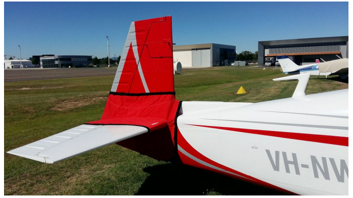
Mooney M20J Tailcone Cover