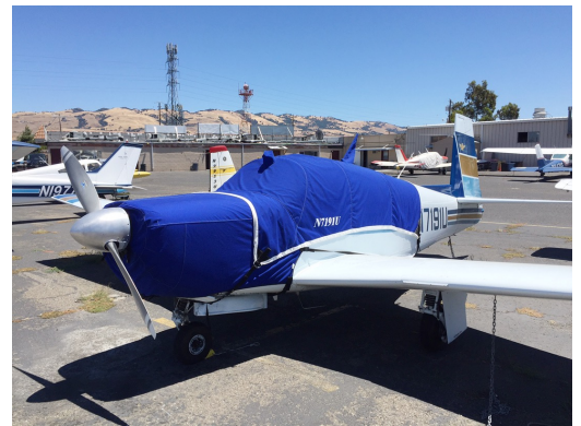
Mooney M20 Canopy & Engine Cover