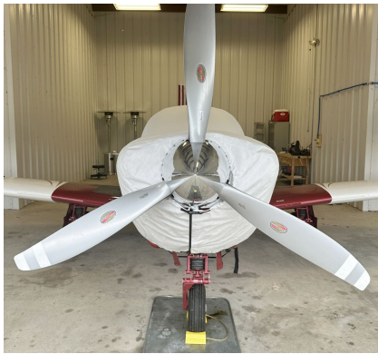
Mooney M20R Extended Canopy/Engine Cover

This cover type is made from Silver Acrylic Sunbrella canvas and is 100% lined with a soft and smooth microfiber. Bruce's Custom Covers developed this material combination especially for aircraft protection. The outer material is medium weight and treated for water resistance, UV resistance and anti-static buildup. The inner lining is a very soft and smooth microfiber to prevent scratching. The material is very reflective, and tests show that the cabin interior temperature can be reduced to near-ambient temperature on the hottest of days. It is water, ice and snow repellent, yet breathable to allow moisture to escape from between the cover and the aircraft surface.