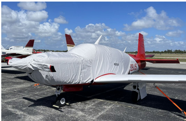
Mooney M20K Extended Canopy/Engine Cover, Prop Cover

This cover type is made from Silver Acrylic Sunbrella canvas and is 100% lined with a soft and smooth microfiber. Bruce's Custom Covers developed this material combination especially for aircraft protection. The outer material is medium weight and treated for water resistance, UV resistance and anti-static buildup. The inner lining is a very soft and smooth microfiber to prevent scratching. The material is very reflective, and tests show that the cabin interior temperature can be reduced to near-ambient temperature on the hottest of days. It is water, ice and snow repellent, yet breathable to allow moisture to escape from between the cover and the aircraft surface.