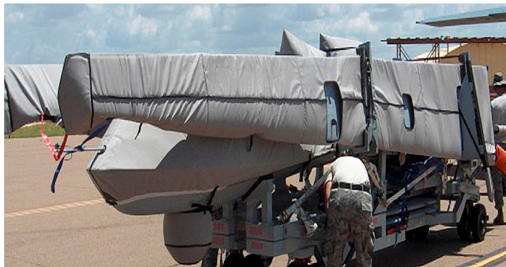
MQ1 Fuselage and Wing Covers

WINTER USE MATERIAL - Made with Solution-Dyed Polyester fabric, this option is intended for seasonal use to aid in deicing, rain mitigation, or for occasional travel. The material is lighter and more compact, but more susceptible to UV damage and may have a shorter useful life if used continuously outside than the all-year use material.