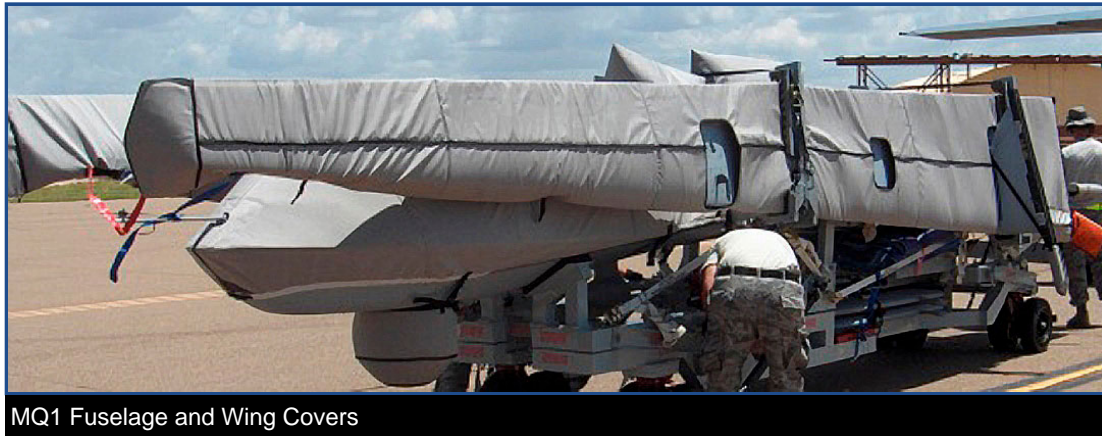
MQ1 Fuselage and Wing Covers