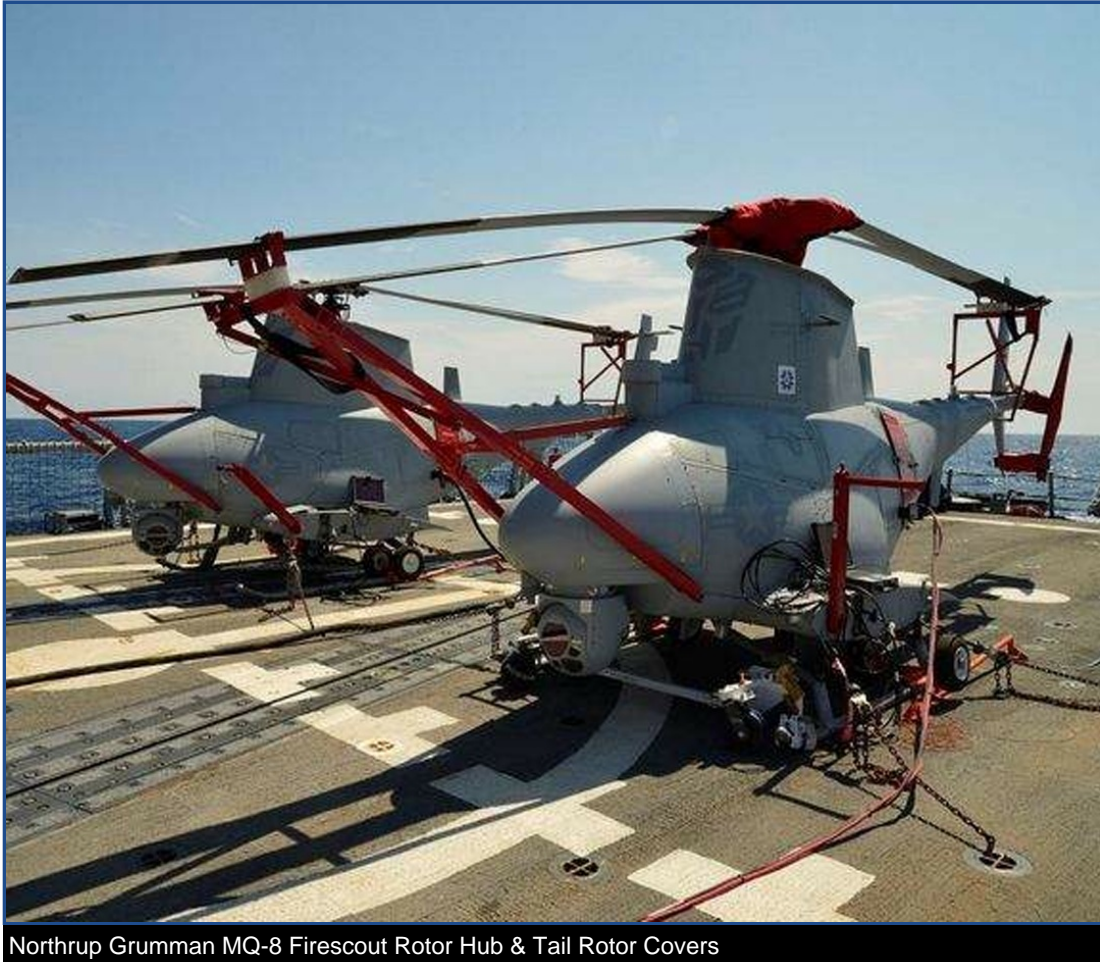
Northrop Grumman MQ-8 Firescout Rotor Hub &amp; Tail Rotor Covers