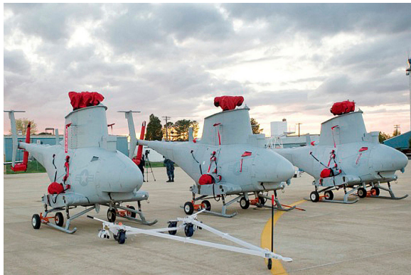
Northrup Grumman MQ-8 Fire Scout Plugs and Covers

necessary. Engine plugs have 'Remove Before Flight' streamers sewn onto the face of the plugs. Most plugs are imprinted with the aircraft registration number in black for an extra charge. Storage bag NOT included. Engine plugs may be inserted after flight when the engine is still warm. Engine Inlet Plugs are commonly referred to as Cowl Plugs, Intake Plugs, Cowl Blocks, Engine Blocks, and Engine Bunges.