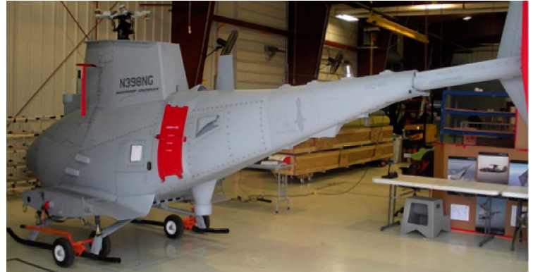
Covers & Plugs for the Northrup Grumman MQ-8 Fire Scout