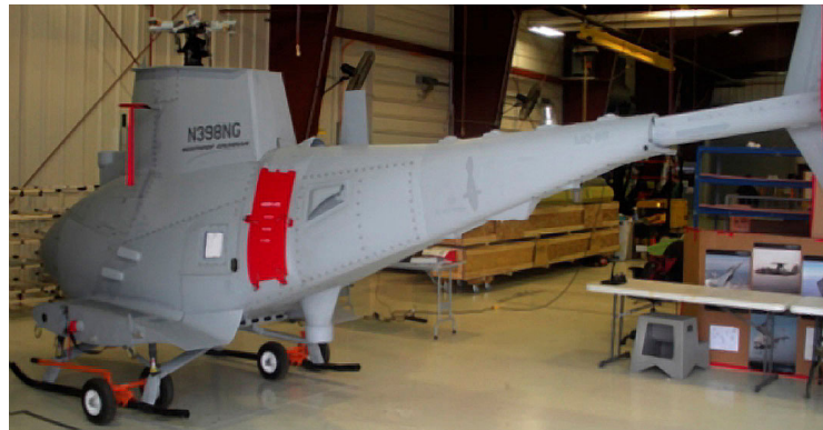
Covers & Plugs for the Northrup Grumman MQ-8 Fire Scout