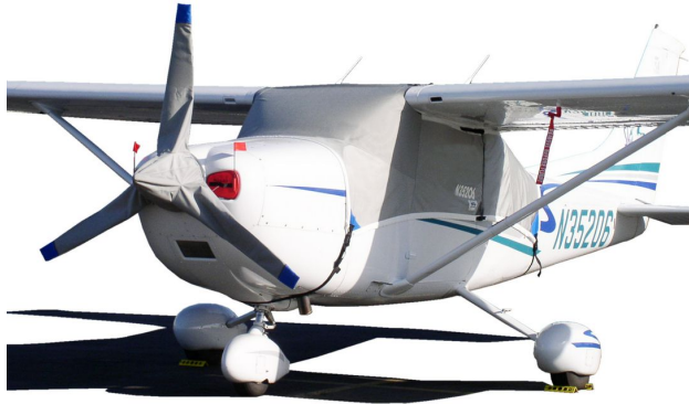
Cessna 182 Canopy Cover, Engine Plugs, 3-Blade Prop Cover

This cover type is made from Silver Acrylic Sunbrella canvas and is 100% lined with a soft and smooth microfiber. Bruce's Custom Covers developed this material combination especially for aircraft protection. The outer material is medium weight and treated for water resistance, UV resistance and anti-static buildup. The inner lining is a very soft and smooth microfiber to prevent scratching. The material is very reflective, and tests show that the cabin interior temperature can be reduced to near-ambient temperature on the hottest of days. It is water, ice and snow repellent, yet breathable to allow moisture to escape from between the cover and the aircraft surface.