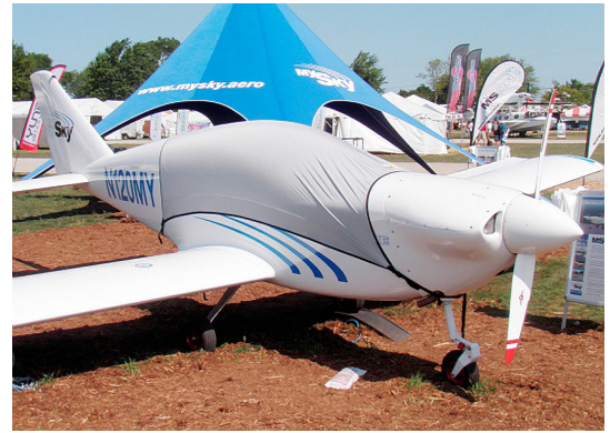
Mysky Fly-Away Travel Cover