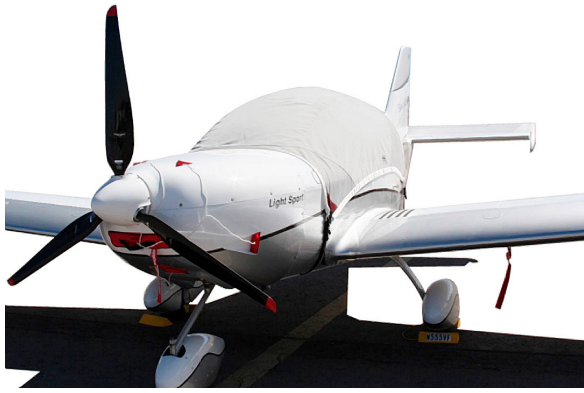
Sportcruiser Canopy Cover & Plugs