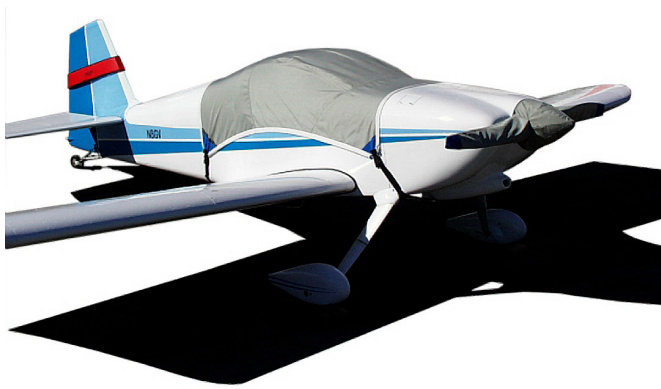
Canopy Cover, Prop Cover

Travel Covers are made with Silver Solution-Dyed Polyester fabric and only lined over the windshield to save weight. The material is lightweight and more compact for easy stowage in the aircraft. The polyester material is water resistant, but only intended for occasional use outside. We also have an ultra lightweight material available for fitted hangar dust covers. For daily outdoor use, the non-travel Sunbrella Cover is the best choice.