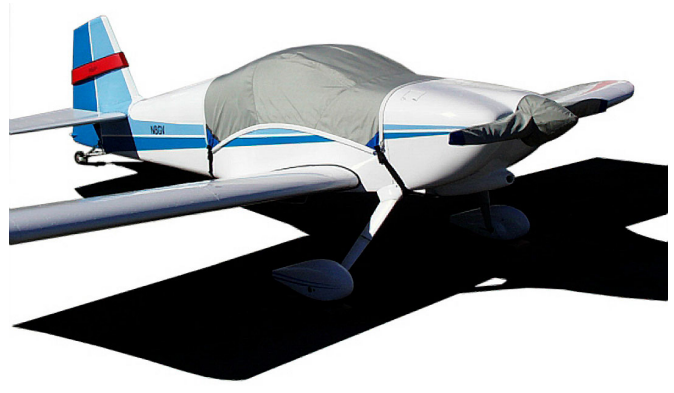
Canopy Cover, Prop Cover