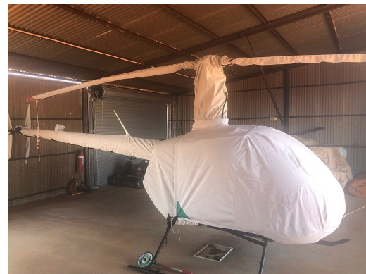
Robinson R-22 Full Cover Set