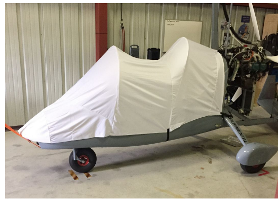
Magni M16 Autogyro Canopy/Nose Cover, test fit cover