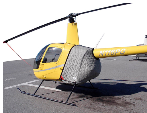
Robinson R-22 Insulated Engine Cover (also covers bottom) & Front Blade Tie-down