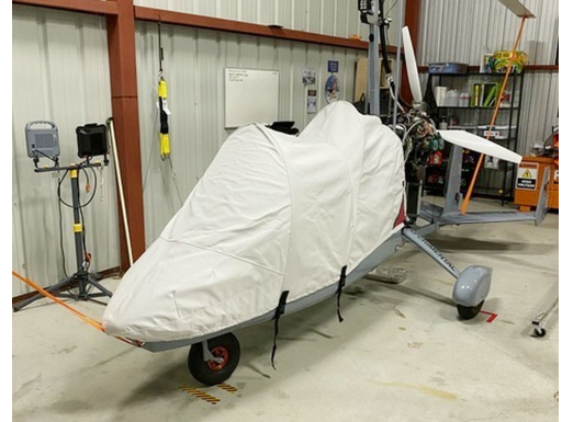
Magni Auto Gyro M16 Cockpit/Nose Cover