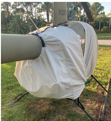
Robinson R-22 Engine Cover

Bruce's Autogyro MTO Sport, 2010, 2017 Gyrocopter Blade Covers are made of medium-weight Solution-Dyed Polyester and designed to avoid trim tabs or wicks. You can install Blade Covers from the ground with the aid of a lightweight rope attached to the open end. Covers are cinched tight at the blade root with straps and quick-release plastic buckles. The Cold Weather Blade Covers are fitted with full-length zippers and optional deice "boots" designed to accept a preheater hose; a small opening at the tip of the cover allows for some air circulation and drainage in freezing weather. Some part numbers have features for an extra charge.