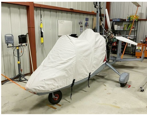
Magni Auto Gyro M16 Cockpit/Nose Cover