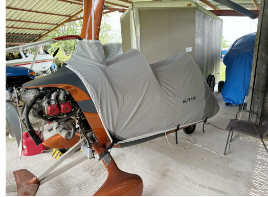
MTO Sport Travel Weight Canopy/Nose Cover