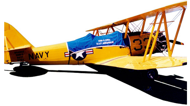
N3N Canopy Cover