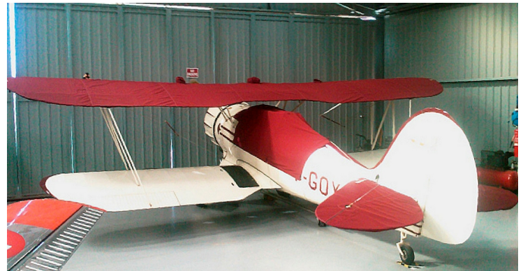
Boeing Stearman PT-13 Canopy, Wing & Horiz. Stab Covers