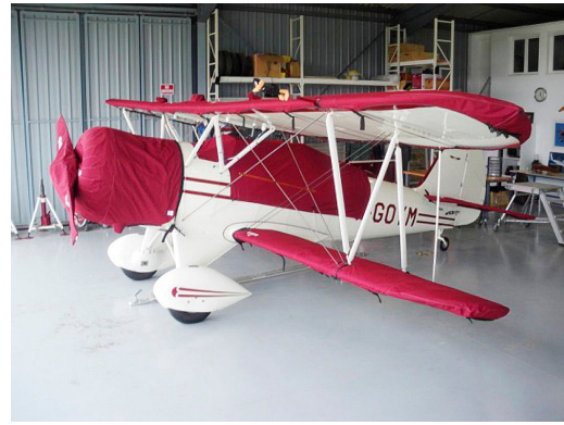
Waco UPF-7 Canopy, Wings, Stab's, Engine, Prop Covers