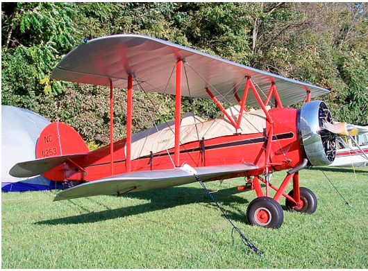
Waco ASO Canopy Cover