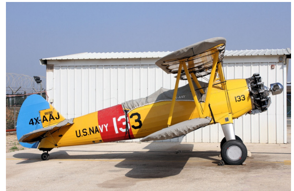
Boeing Stearman PT-13 Canopy, Wing & Horiz. Stab Covers