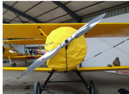
N3N Engine Cover