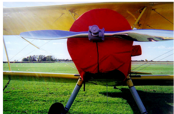
Stearman Engine Cover