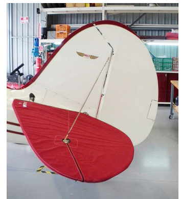
Waco UPF-7 Horizontal Stab. Cover