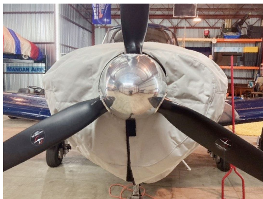
Navion Insulated Engine Cover

This cover type is made from Silver Acrylic Sunbrella canvas and is 100% lined with a soft and smooth microfiber. Bruce's Custom Covers developed this material combination especially for aircraft protection. The outer material is medium weight and treated for water resistance, UV resistance and anti-static buildup. The inner lining is a very soft and smooth microfiber to prevent scratching. The material is very reflective, and tests show that the cabin interior temperature can be reduced to near-ambient temperature on the hottest of days. It is water, ice and snow repellent, yet breathable to allow moisture to escape from between the cover and the aircraft surface.