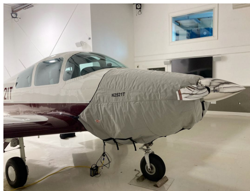
NAVION H Insulated Engine Cover