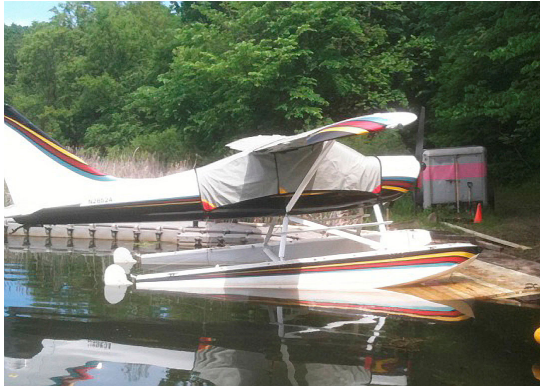
Glstar Sportsman Canopy Cover

This cover type is made from Silver Acrylic Sunbrella canvas and is 100% lined with a soft and smooth microfiber. Bruce's Custom Covers developed this material combination especially for aircraft protection. The outer material is medium weight and treated for water resistance, UV resistance and anti-static buildup. The inner lining is a very soft and smooth microfiber to prevent scratching. The material is very reflective, and tests show that the cabin interior temperature can be reduced to near-ambient temperature on the hottest of days. It is water, ice and snow repellent, yet breathable to allow moisture to escape from between the cover and the aircraft surface.