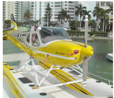
Glastar Engine Plugs