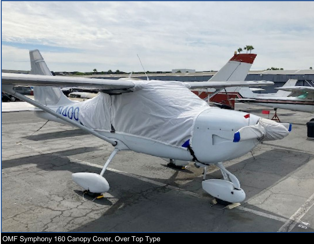
OMF Symphony 160 Canopy Cover, Over Top Type