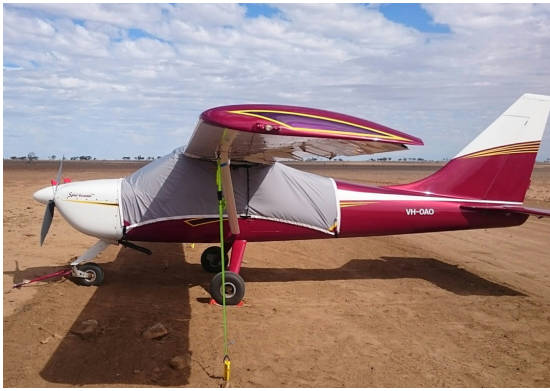
Glastar Sportsman Light Weight Travel Cover