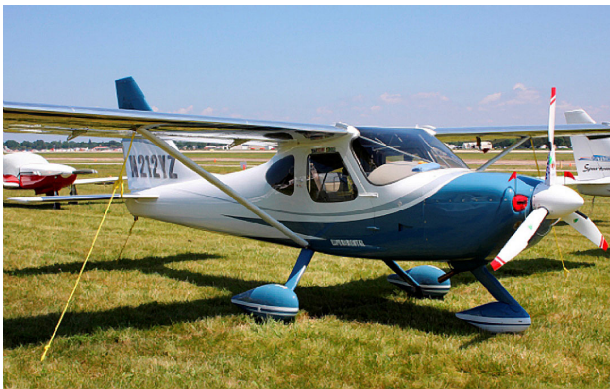
Glastar Sportsman Engine Inlet Plugs

Engine Inlet Plugs are custom fit for your OMF Symphony 160 intakes, made with heavy-duty vinyl material, and stuffed with a single block of sculpted urethane foam. Each plug has a zipper that allows the foam to be removed and dried if necessary. Engine plugs have warning flags that are visible from the cockpit or 'remove before flight' streamers sewn onto the face of the plugs. Most plugs are imprinted with the aircraft registration number in black for an extra charge. Storage bag NOT included. Engine plugs may be inserted after flight when the engine is still warm. Engine Inlet Plugs are commonly referred to as Cowl Plugs, Intake Plugs, Cowl Blocks, Engine Blocks, and Engine Bungs.