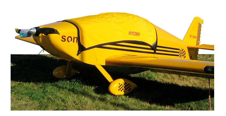
Sonex Canopy Cover