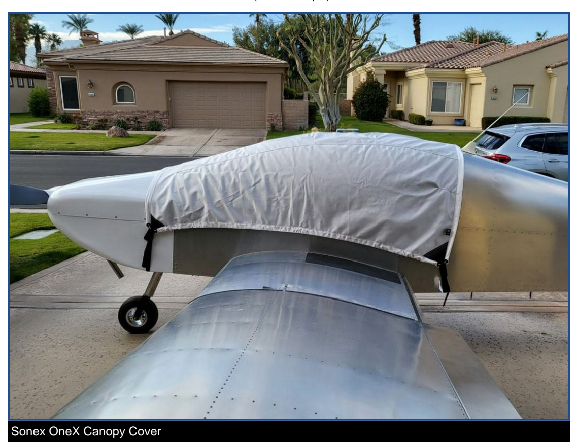
Section 1: Canopy/Cockpit/Fuselage Covers

Canopy Covers help reduce damage to your airplane's upholstery and avionics caused by excessive heat, and they can eliminate problems caused by leaking door and window seals. They keep the windshield and window surfaces clean and help prevent vandalism and theft.