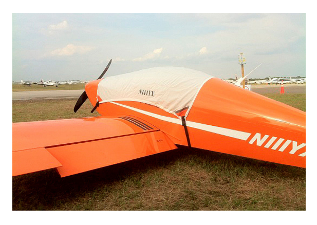
Sonex Canopy Cover