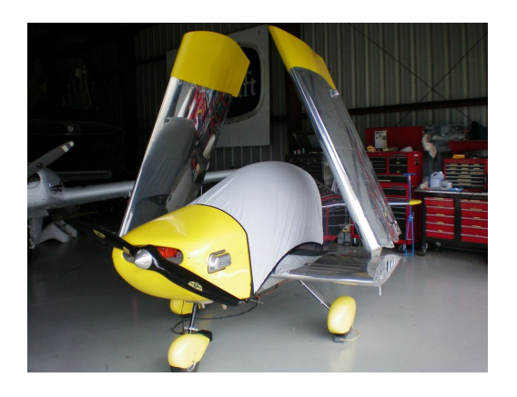
Onex Flyaway Cover