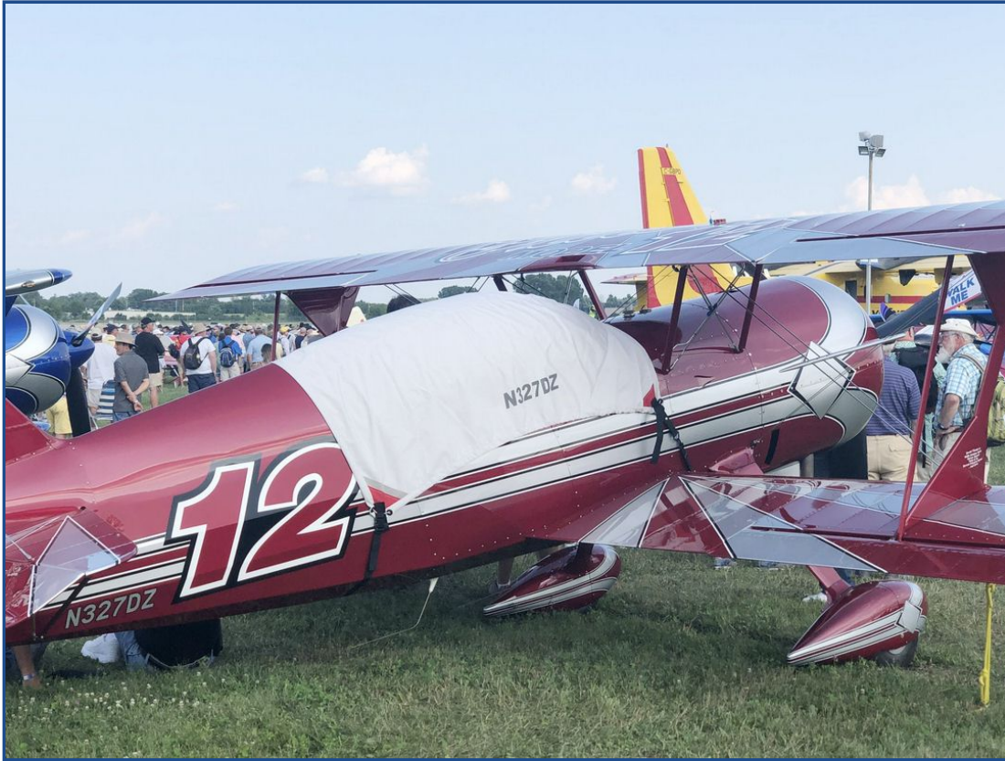
Pitts Model 12 Canopy Cover