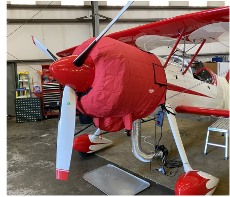
Pitts Model 12 Insulated Engine Cover