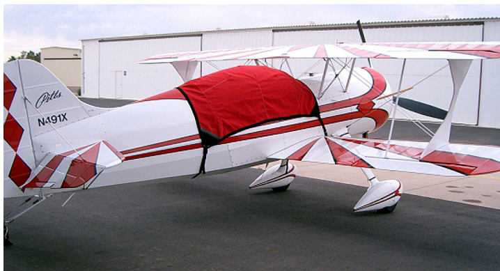
Pitts Model 12 Canopy Cover