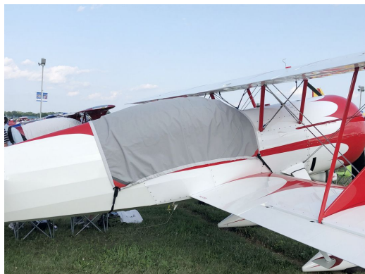
Pitts Model 12 Canopy Cover

Travel Covers are made with Silver Solution-Dyed Polyester fabric and only lined over the windshield to save weight. The material is lightweight and more compact for easy stowage in the aircraft. The polyester material is water resistant, but only intended for occasional use outside. We also have an ultra lightweight material available for fitted hangar dust covers. For daily outdoor use, the non-travel Sunbrella Cover is the best choice.