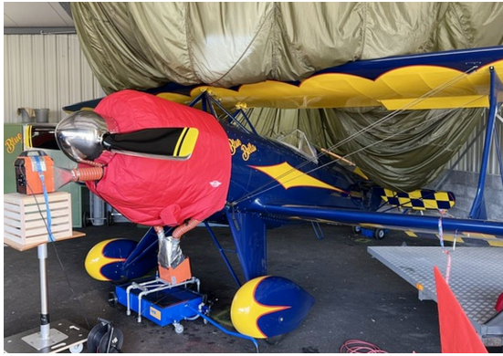
Culp Special Insulated Engine Cover

the hottest of days. It is water, ice and snow repellent, yet breathable to allow moisture to escape from between the cover and the aircraft surface.