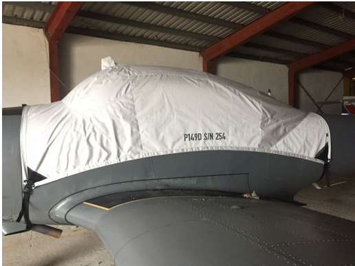
Piaggio P149D Canopy Cover

Cover and Engine Cover. This cover will enclose the engine cowl and will extend aft to cover all of the windows. This cover type is made from Silver Acrylic Sunbrella canvas and is 100% lined with a soft and smooth microfiber. Bruce's Custom Covers developed this material combination especially for aircraft protection. The outer material is medium weight and treated for water resistance, UV resistance and anti-static buildup. The inner lining is a very soft and smooth microfiber to prevent scratching. The material is very reflective, and tests show that the cabin interior temperature can be reduced to near-ambient temperature on the hottest of days. It is water, ice and snow repellent, yet breathable to allow moisture to escape from between the cover and the aircraft surface.