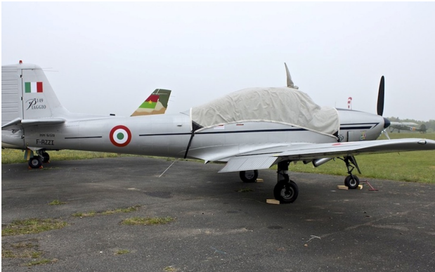
Piaggio P-149 Canopy Cover