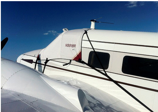
Beech 18 Cockpit Cover

This cover type is made from Silver Acrylic Sunbrella canvas and is 100% lined with a soft and smooth microfiber. Bruce's Custom Covers developed this material combination especially for aircraft protection. The outer material is medium weight and treated for water resistance, UV resistance and anti-static buildup. The inner lining is a very soft and smooth microfiber to prevent scratching. The material is very reflective, and tests show that the cabin interior temperature can be reduced to near-ambient temperature on the hottest of days. It is water, ice and snow repellent, yet breathable to allow moisture to escape from between the cover and the aircraft surface.