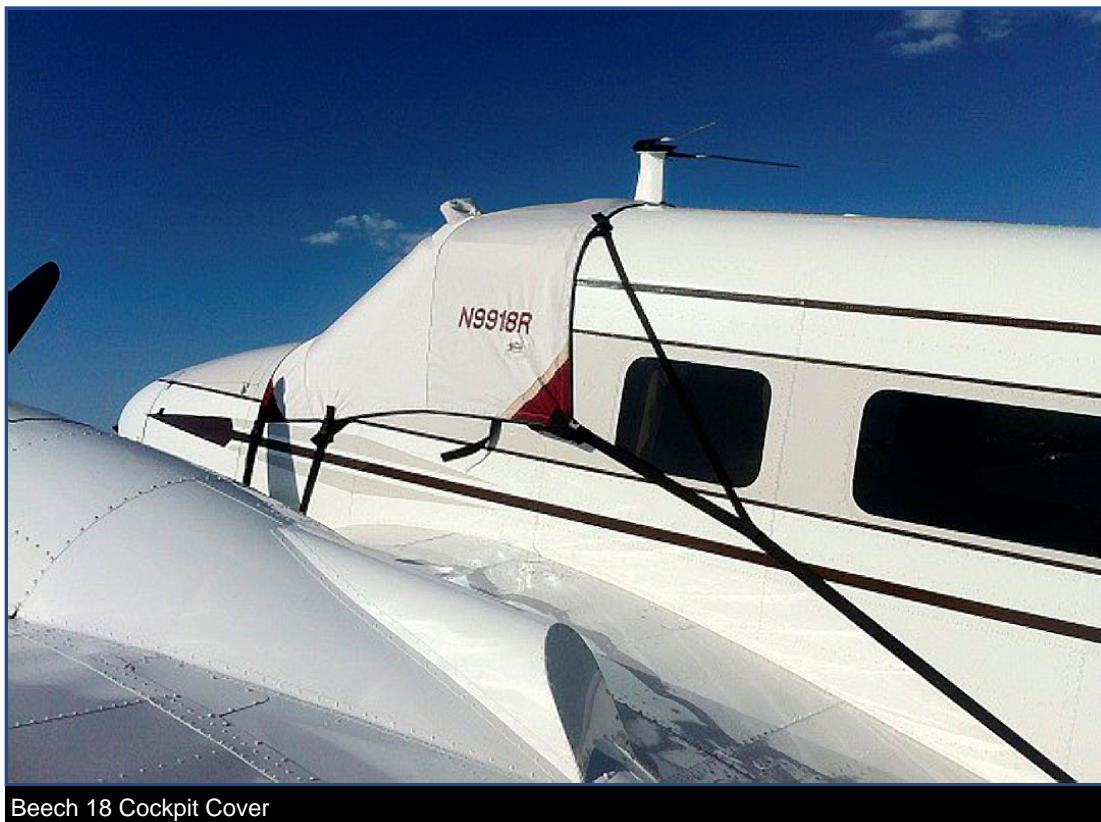
Beech 18 Cockpit Cover