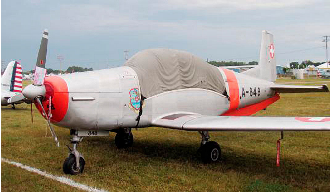
Pilatus P-3 Canopy Cover

Covers developed this material combination especially for aircraft protection. The outer material is medium weight and treated for water resistance, UV resistance and anti-static buildup. The inner lining is a very soft and smooth microfiber to prevent scratching. The material is very reflective, and tests show that the cabin interior temperature can be reduced to near-ambient temperature on the hottest of days. It is water, ice and snow repellent, yet breathable to allow moisture to escape from between the cover and the aircraft surface.