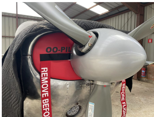
Pilatus P-3 Engine Plugs

Engine Inlet Plugs are custom fit for your Pilatus P-3 intakes, made with heavy-duty vinyl material, and stuffed with a single block of sculpted urethane foam. Each plug has a zipper that allows the foam to be removed and dried if necessary. Engine plugs have warning flags that are visible from the cockpit or 'remove before flight' streamers sewn onto the face of the plugs. Most plugs are imprinted with the aircraft registration number in black for an extra charge. Storage bag NOT included. Engine plugs may be inserted after flight when the engine is still warm. Engine Inlet Plugs are commonly referred to as Cowl Plugs, Intake Plugs, Cowl Blocks, Engine Blocks, and Engine Bungs.