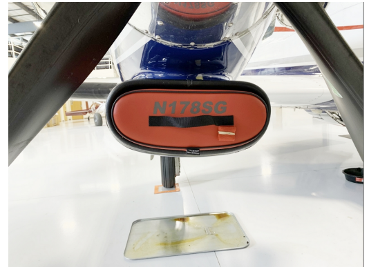
Piper Cheyenne Engine Inlet Plugs