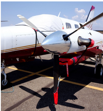
Piper Cheyenne Cockpit Cover, Engine Plugs, Prop Tie/Exhaust Covers

Travel Covers are made with Silver Solution-Dyed Polyester fabric and only lined over the windshield to save weight. The material is lightweight and more compact for easy stowage in the aircraft. The polyester material is water resistant, but only intended for occasional use outside. We also have an ultra lightweight material available for fitted hangar dust covers. For daily outdoor use, the non-travel Sunbrella Cover is the best choice.