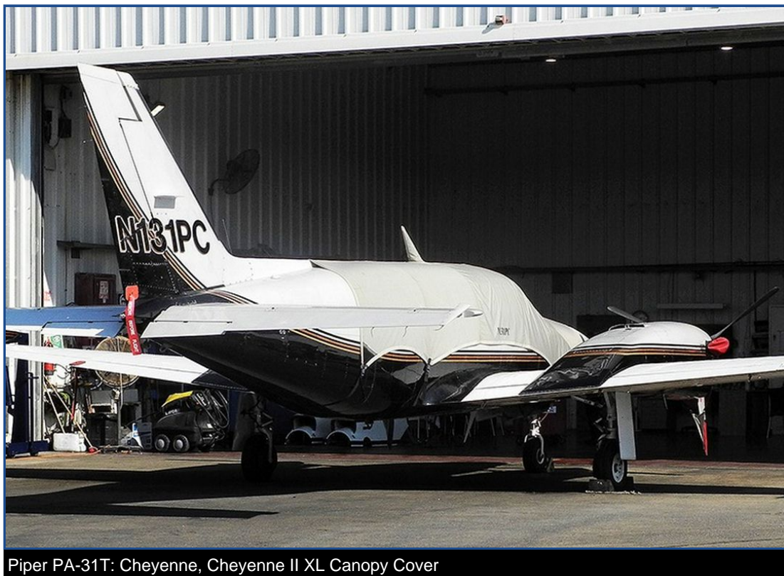
Piper PA-31T: Cheyenne, Cheyenne II XL Canopy Cover