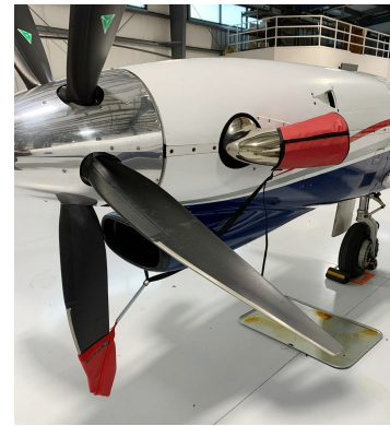
Casa 212 Insulated Engine & Propeller/Spinner Covers