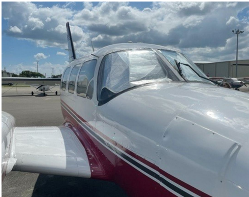
Piper PA-31 Models Cockpit HeatShields

Cockpit Heatshields are interior sunshades for the aircraft's cockpit. The product is a unique composite of closed-cell foam with a silver mylar finish. The semi-rigid design is stiff enough to stand inside the window framing. The set folds up flat and is easily stored in the included storage sleeve. Some designs may require velcro and suction cups. A Heatshield is an excellent short-term remedy for cockpit overheating, but an external fabric cover is more effective for long-term protection.