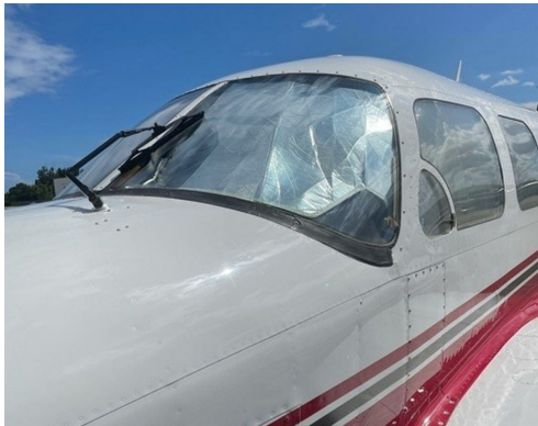
Piper PA-31 Models Cockpit HeatShields