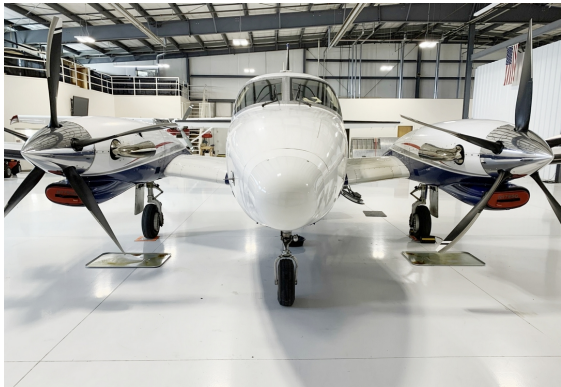
Piper Cheyenne Engine Inlet Plugs

Engine Inlet Plugs are custom fit for your Piper PA-31T: Cheyenne, Cheyenne II XL intakes, made with heavy-duty vinyl material, and stuffed with a single block of sculpted urethane foam. Each plug has a zipper that allows the foam to be removed and dried if necessary. Engine plugs have warning flags that are visible from the cockpit or 'remove before flight' streamers sewn onto the face of the plugs. Most plugs are imprinted with the aircraft registration number in black for an extra charge. Storage bag NOT included. Engine plugs may be inserted after flight when the engine is still warm. Engine Inlet Plugs are commonly referred to as Cowl Plugs, Intake Plugs, Cowl Blocks, Engine Blocks, and Engine Bungs.