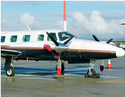
Piper Cheyenne IIXL Prop Tie/Exhaust Covers, Intake Plugs

Engine Inlet Plugs are custom fit for your Piper PA-31T: Cheyenne, Cheyenne II XL intakes, made with heavy-duty vinyl material, and stuffed with a single block of sculpted urethane foam. Each plug has a zipper that allows the foam to be removed and dried if necessary. Engine plugs have warning flags that are visible from the cockpit or 'remove before flight' streamers sewn onto the face of the plugs. Most plugs are imprinted with the aircraft registration number in black for an extra charge. Storage bag NOT included. Engine plugs may be inserted after flight when the engine is still warm. Engine Inlet Plugs are commonly referred to as Cowl Plugs, Intake Plugs, Cowl Blocks, Engine Blocks, and Engine Bungs.